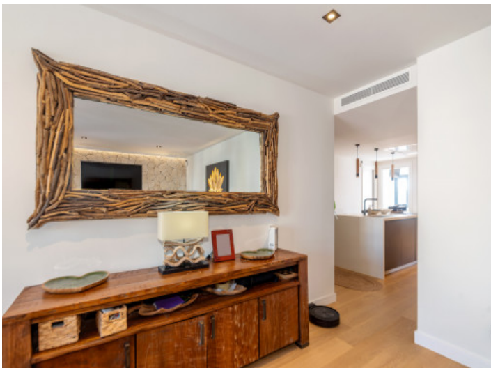
Ducted air conditioning