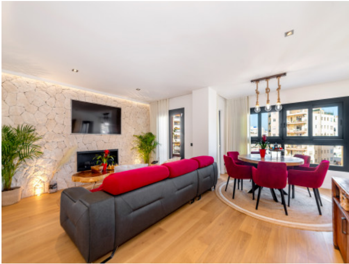
Stylish, modernised apartment with parking space in the centre of Palma