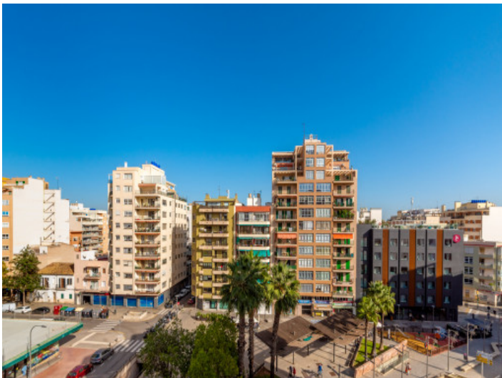
Balcony with city views