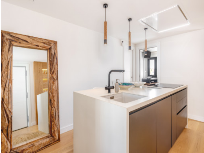
Large kitchen island