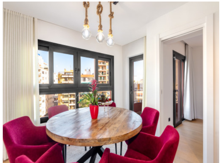
Bright dining room