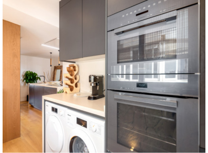
High quality appliance