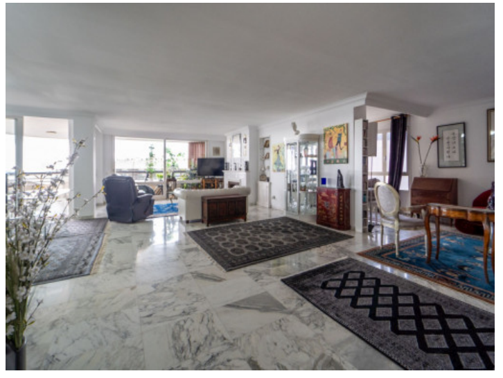
Sunny living area