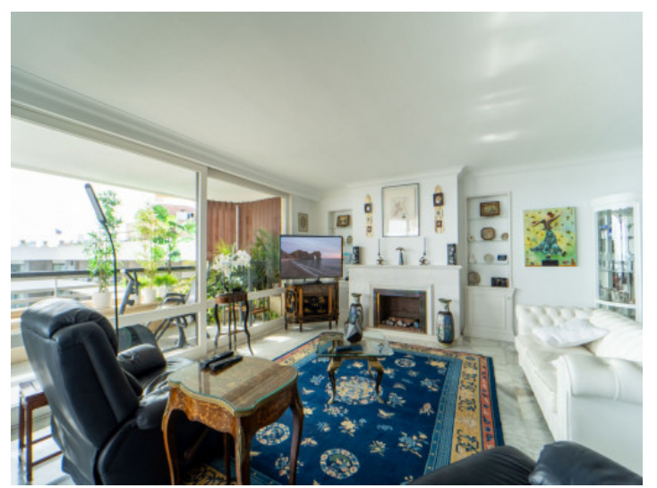
Large living area Dining area All information is correct to the best of our knowledge. Errors and prior sale excepted. This prospectus is purely for information purposes. Only the notarized deed of sale is legally binding.

PORTA MALLORQUINA • THERESIENSTR.: 81, 80333 MUNICH TEL. +34 971 698 242 • INFO@PORTAMALLORQUINA.COM