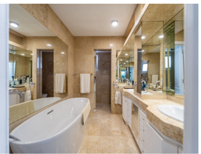
Bathroom en suite Cozy bedrooms All information is correct to the best of our knowledge. Errors and prior sale excepted. This prospectus is purely for information purposes. Only the notarized deed of sale is legally binding.

PORTA MALLORQUINA • THERESIENSTR.: 81, 80333 MUNICH TEL. +34 971 698 242 • INFO@PORTAMALLORQUINA.COM