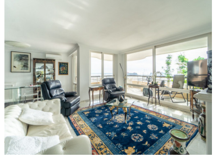
Living area with sea views