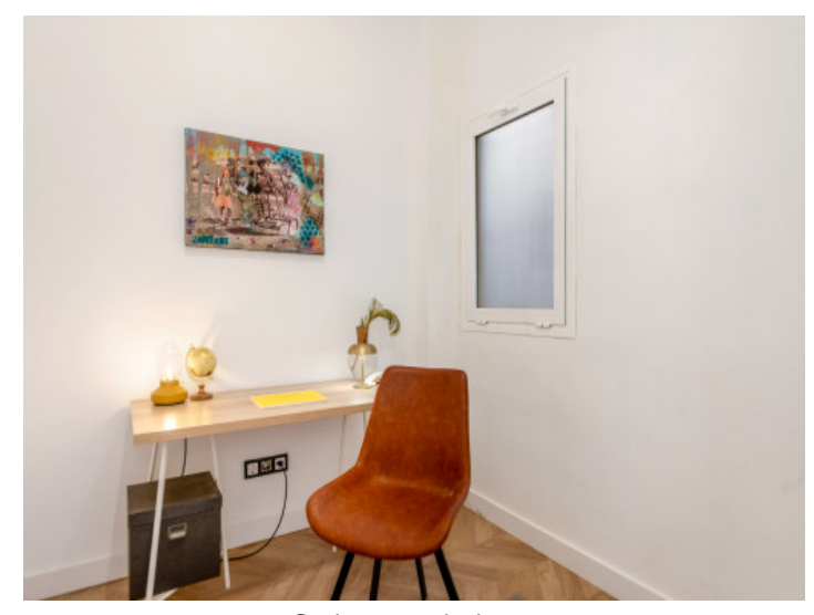
Study room or bedroom