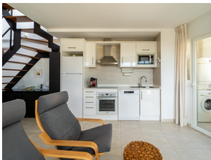
Living, dining and kitchen area

All information is correct to the best of our knowledge. Errors and prior sale excepted. This prospectus is purely for information purposes. Only the notarized deed of sale is legally binding.