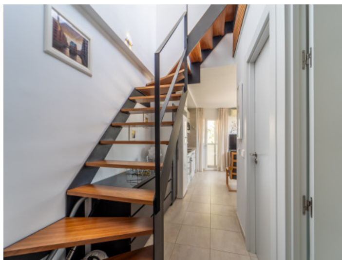
Staircase to the rooftop terrace