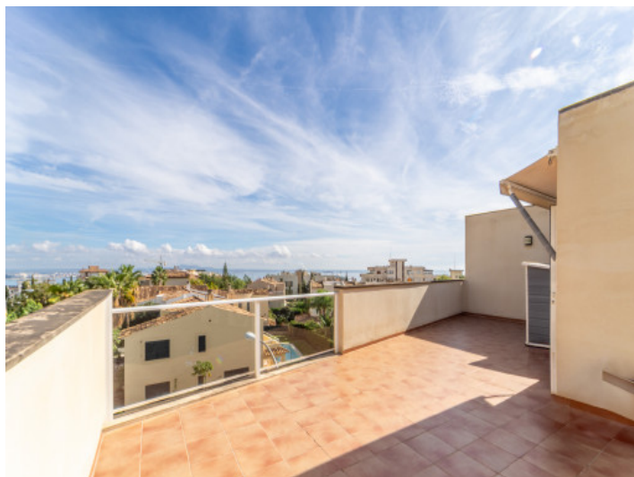
Rooftop terrace with sea views