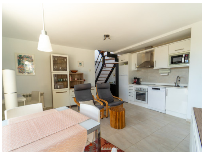
Living, dining and kitchen area