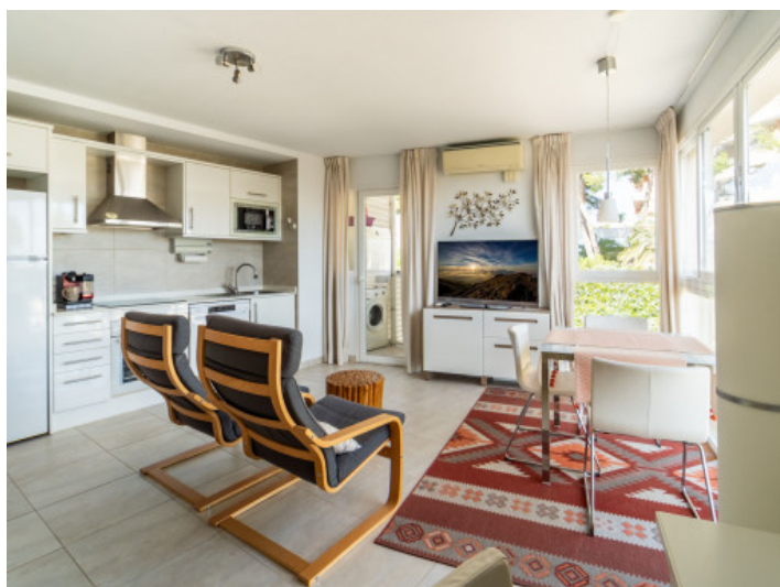
Living, dining and kitchen area