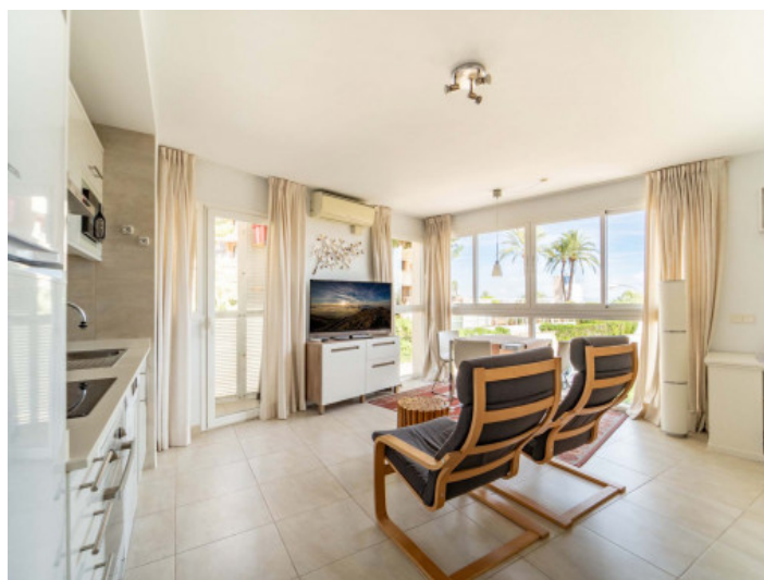
Living, dining and kitchen area