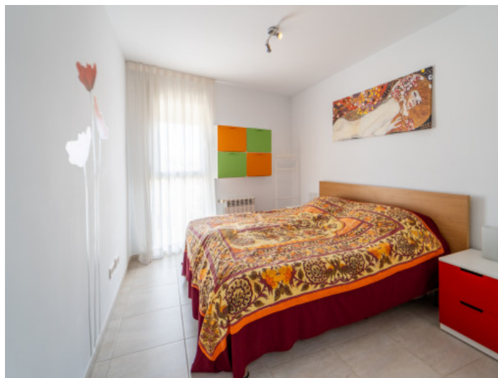
One bedroom apartment