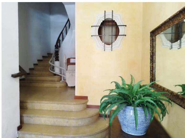
Entrance hall building