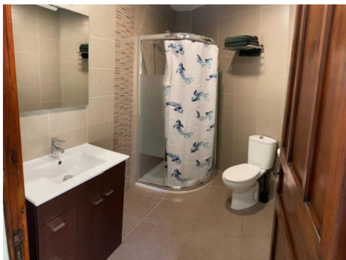
Flat with one bathroom