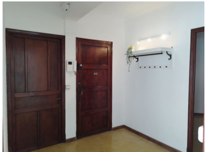
Entrance hall flat

All information is correct to the best of our knowledge. Errors and prior sale excepted. This prospectus is purely for information purposes. Only the notarized deed of sale is legally binding.