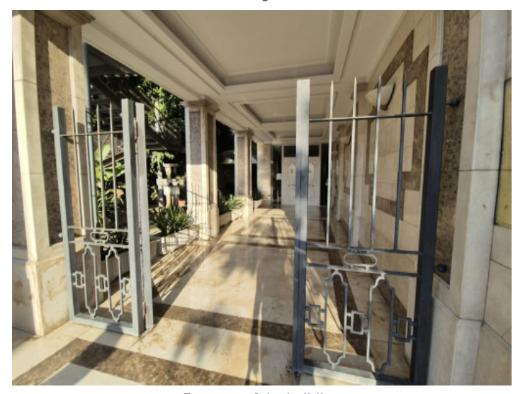
Entrance of the building