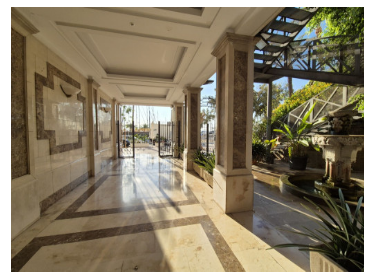
Main entrance of the building