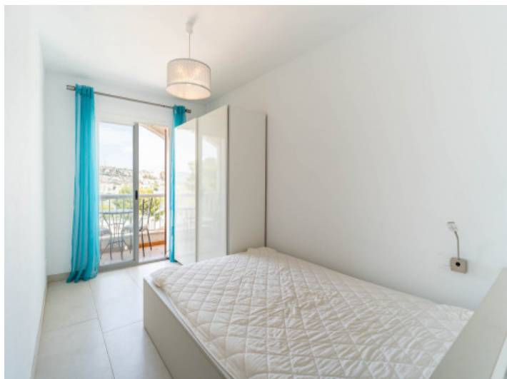
One of 3 bedrooms