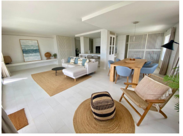
Amazing sea views