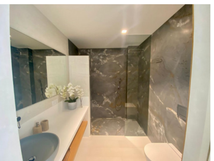
Second bathroom Nice terrace All information is correct to the best of our knowledge. Errors and prior sale excepted. This prospectus is purely for information purposes. Only the notarized deed of sale is legally binding.

PORTA MALLORQUINA • THERESIENSTR.: 81, 80333 MUNICH TEL. +34 971 698 242 • INFO@PORTAMALLORQUINA.COM