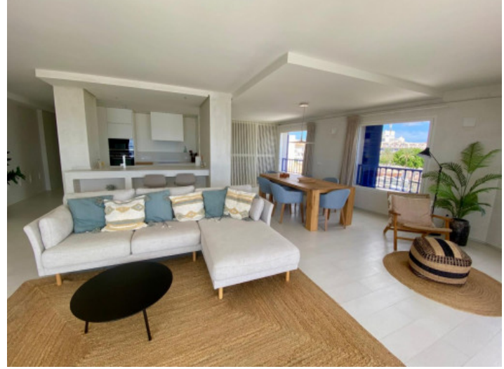
Living and dining area