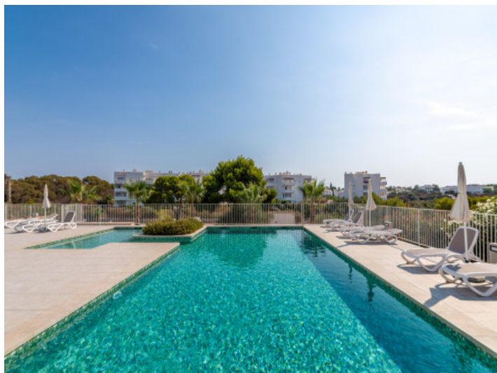
Large community pool