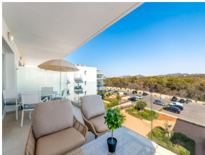
Terrace with far-reaching views