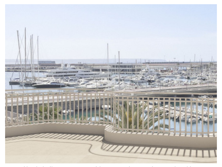
Newly built appartment with spectacular sea views and parking