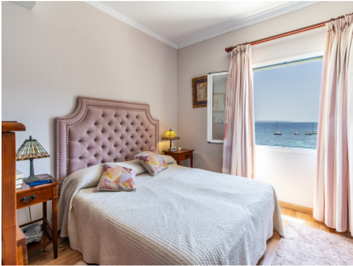
One of 4 bedrooms