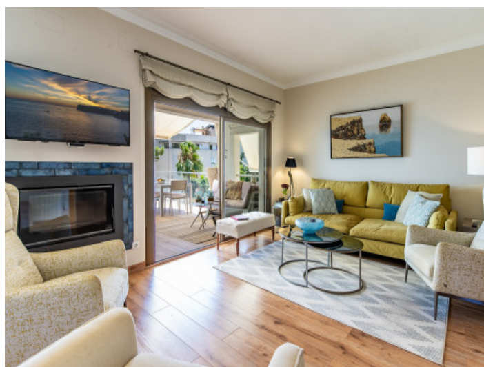
Living area with fireplace

All information is correct to the best of our knowledge. Errors and prior sale excepted. This prospectus is purely for information purposes. Only the notarized deed of sale is legally binding.