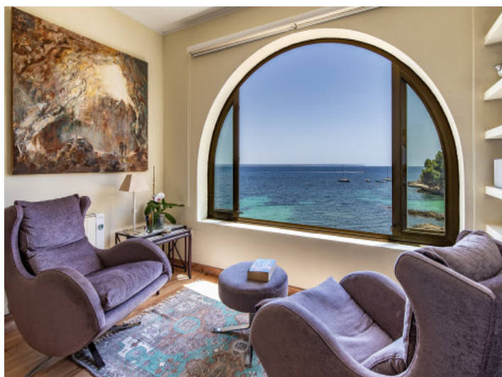
Relaxing reading corner