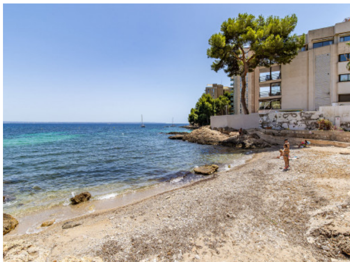
Beach on the doorstep