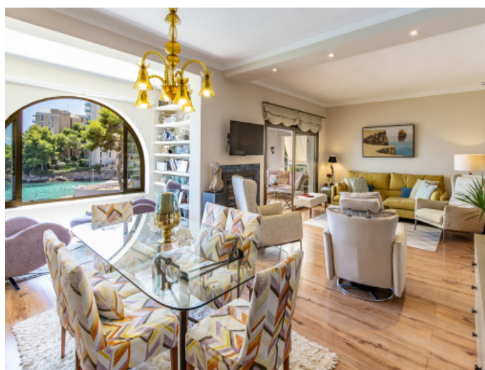
Bright living and dining area