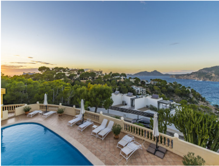
Pool area at sunset