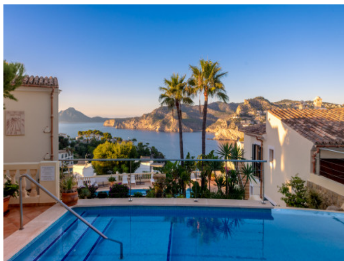
Magnificent sea views