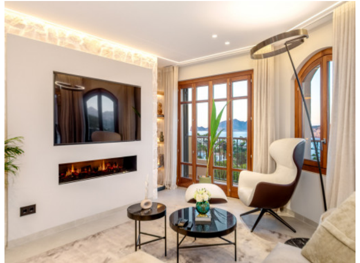
Cozy sitting area