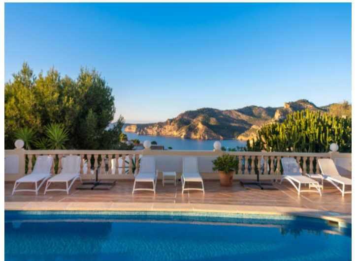
Pool area with mountain and sea views