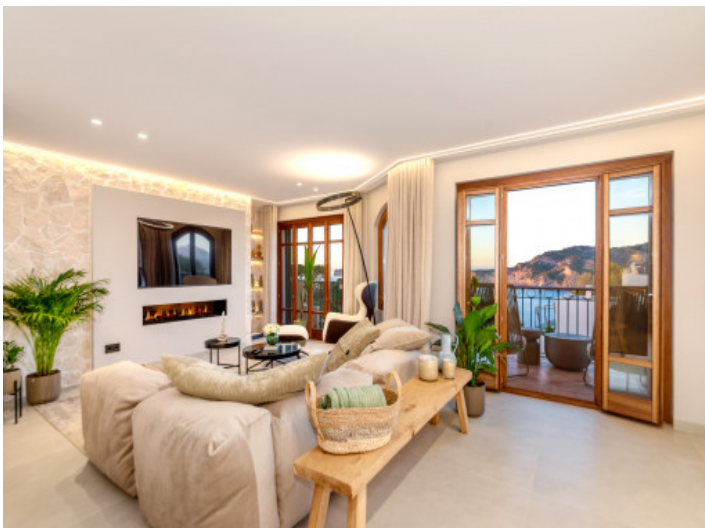
Living area with sea views