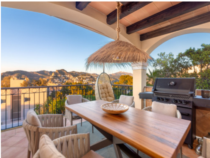
Covered terrace with breathtaking views