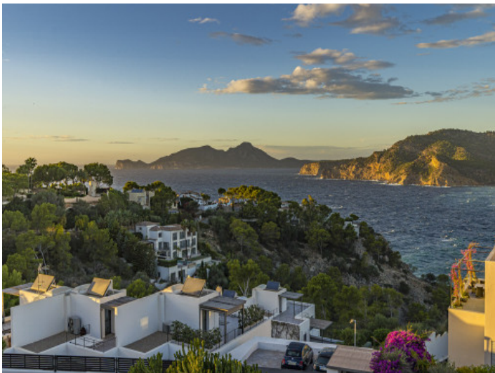
Breathtaking sea and mountain views