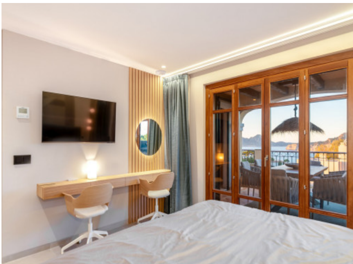
One of 2 bedroom