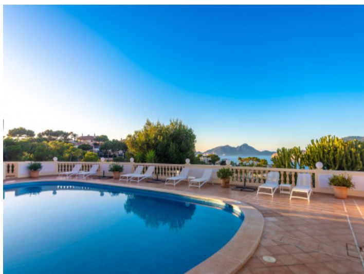
Superb community pool