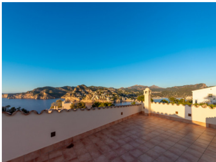
Roof terrace with panoramic views