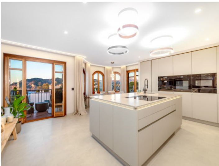
Fantastic kitchen with a view