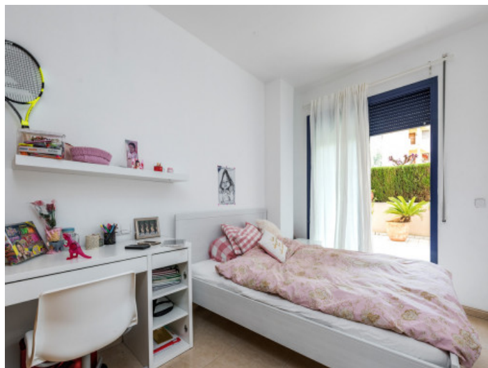
Lovely bedroom with terrace access