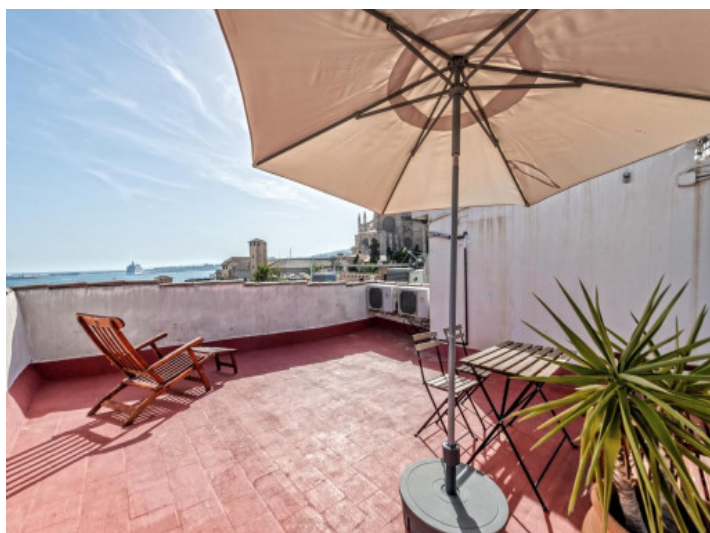
Community roof terrace