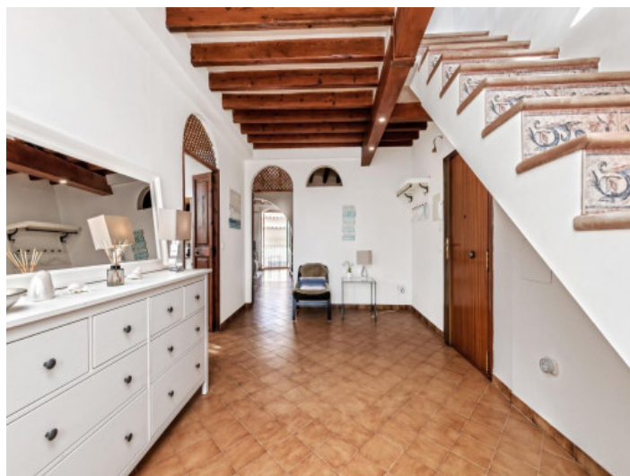
Staircase to the lounge area

All information is correct to the best of our knowledge. Errors and prior sale excepted. This prospectus is purely for information purposes. Only the notarized deed of sale is legally binding.