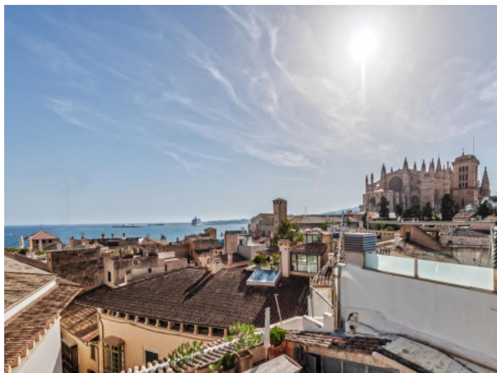
Views from the Lounge area