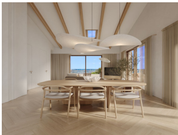
Reception entrance area