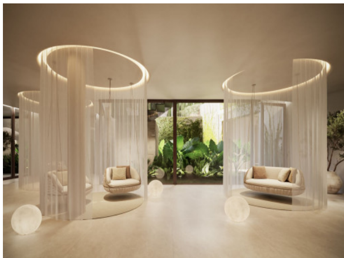
SPA entrance hall