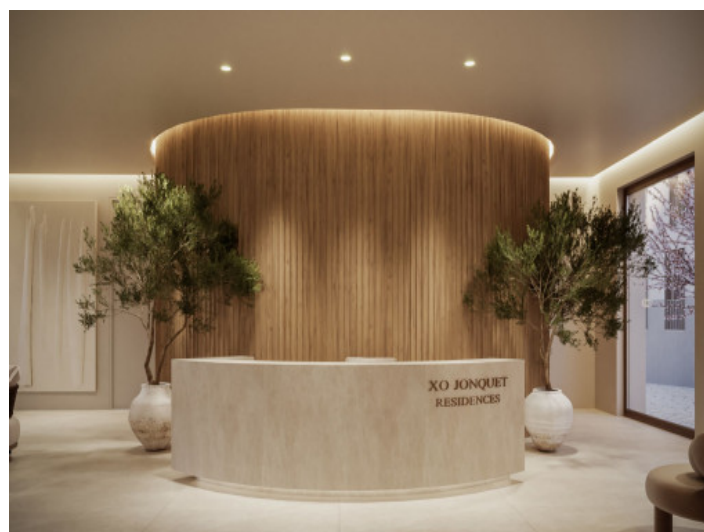
Reception entrance area of the building

All information is correct to the best of our knowledge. Errors and prior sale excepted. This prospectus is purely for information purposes. Only the notarized deed of sale is legally binding.