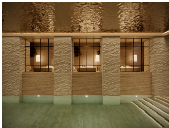
SPA and pool