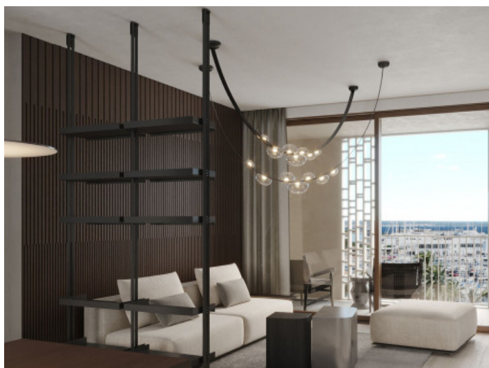
Living area with harbor view