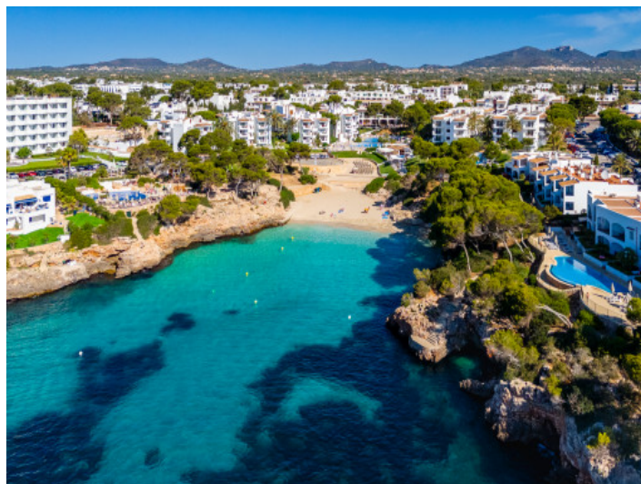
Close to the beach