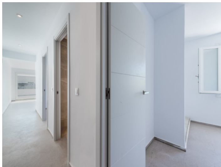
View from the entrance into the flat