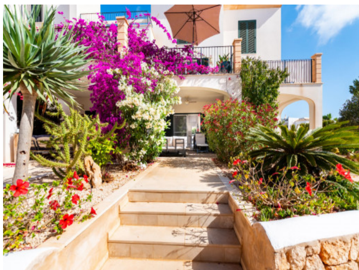
View to the building