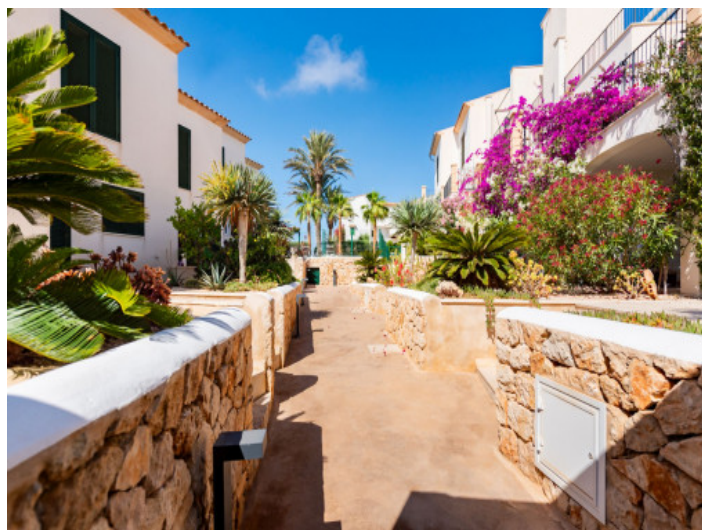
View to the community

All information is correct to the best of our knowledge. Errors and prior sale excepted. This prospectus is purely for information purposes. Only the notarized deed of sale is legally binding.