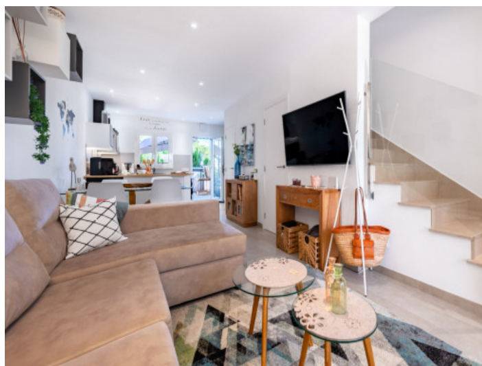
Open room layout