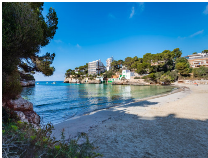
Beach Cala Santanyi