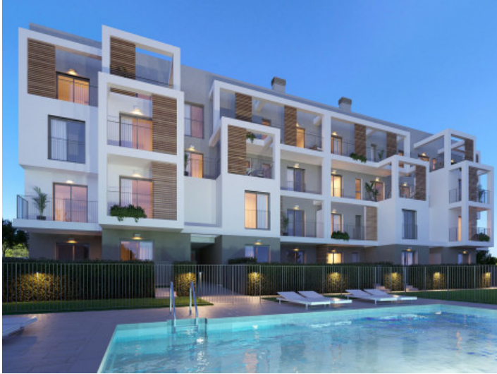
View to the building