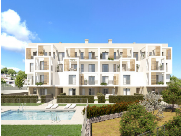
Pool and garden area