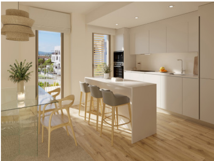
Dining and kitchen area