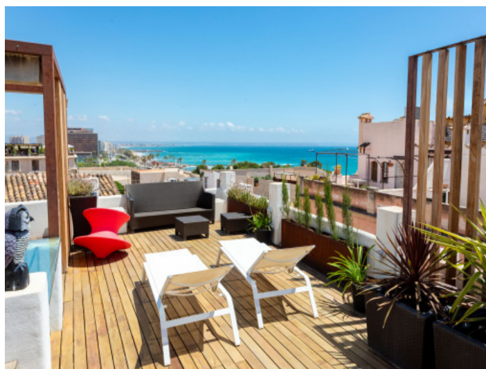
Close to the beach