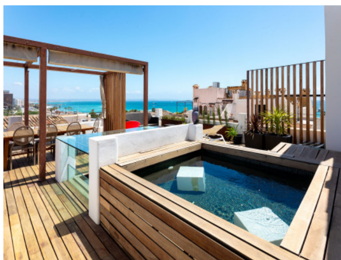
Rooftop with pool