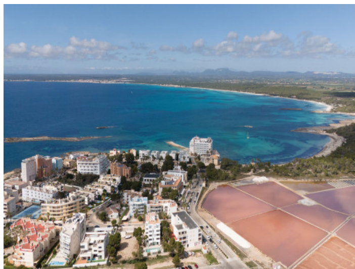
Colonia Sant Jordi

All information is correct to the best of our knowledge. Errors and prior sale excepted. This prospectus is purely for information purposes. Only the notarized deed of sale is legally binding.