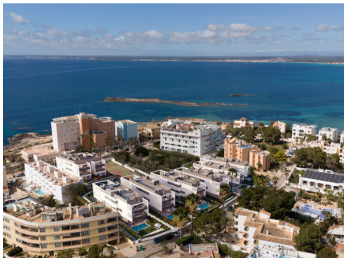
Nice village in the southeast