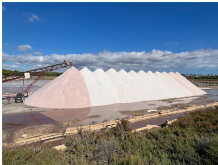
Es Trenc salt marshes