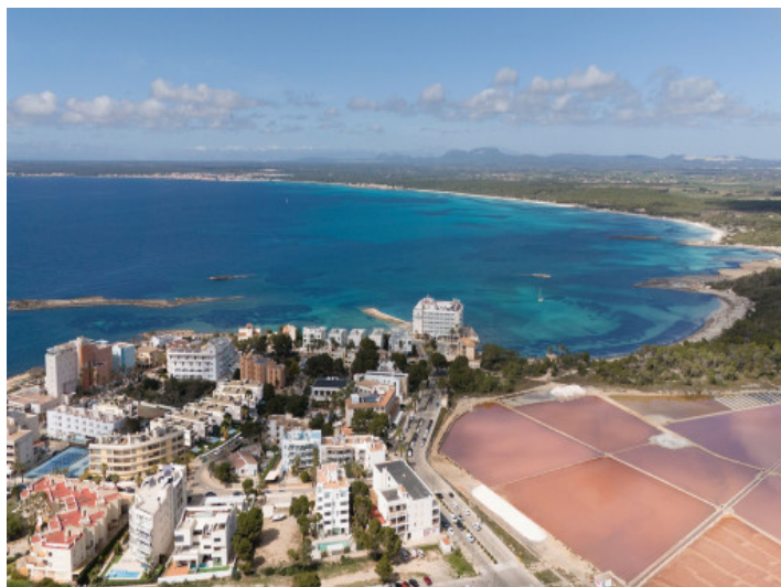
Colonia Sant Jordi