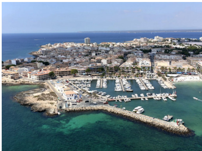
Harbour of Colonia Sant Jordi