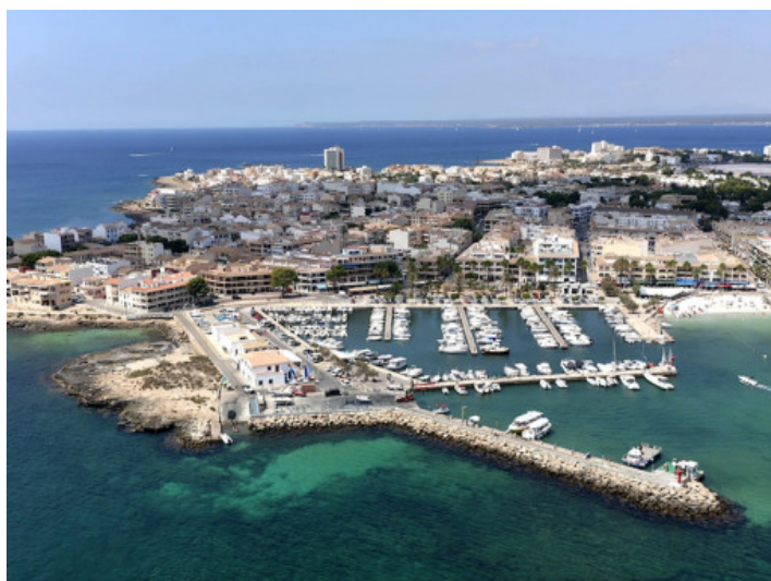
Harbour of Colonia Sant Jordi