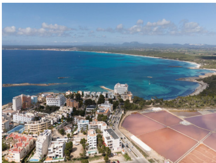
Colonia Sant Jordi