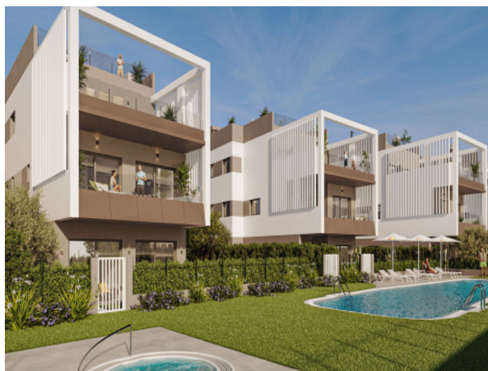
Facade and Community pool