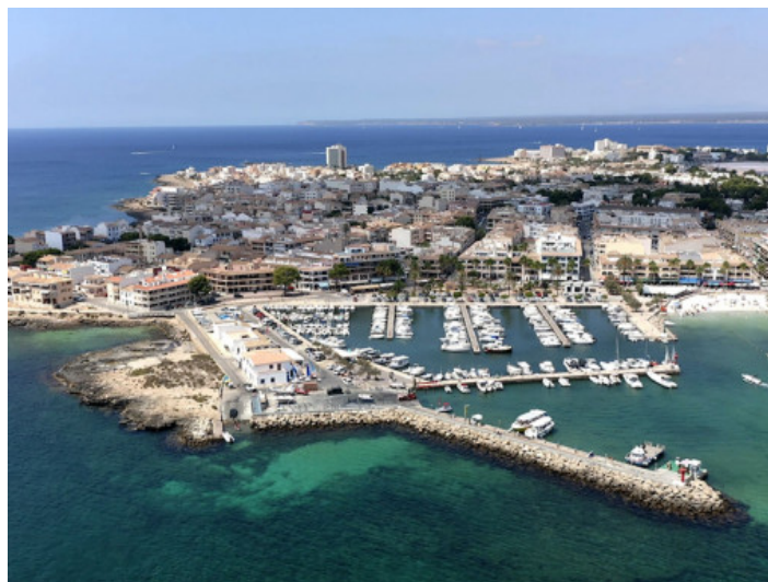
Harbour of Colonia Sant Jordi