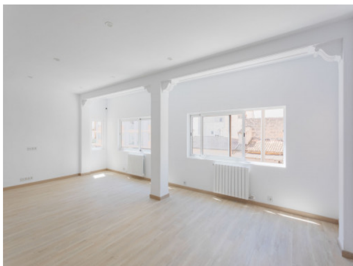
Bright, newly renovated apartment with large terrace to feel at home in