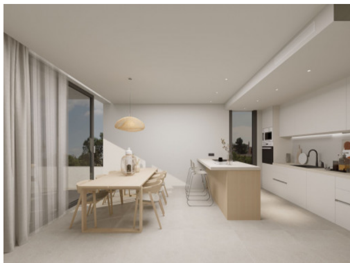
Open kitchen and dining area

All information is correct to the best of our knowledge. Errors and prior sale excepted. This prospectus is purely for information purposes. Only the notarized deed of sale is legally binding.