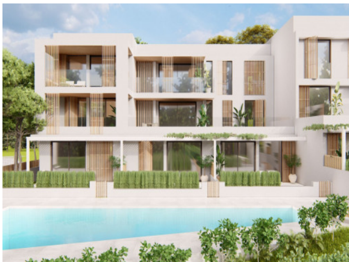
View to the complex