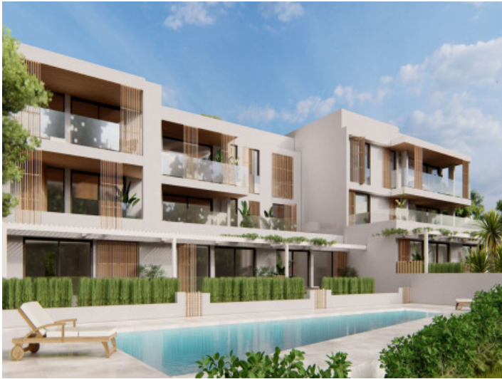
A fantastic new build ground floor flat in Porto Petro