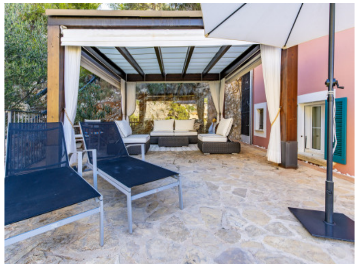
Terrace with lounge area

All information is correct to the best of our knowledge. Errors and prior sale excepted. This prospectus is purely for information purposes. Only the notarized deed of sale is legally binding.