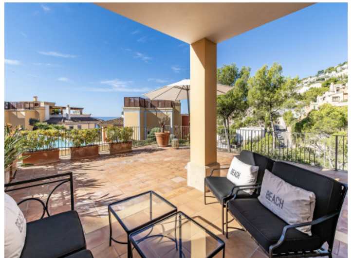
Partially covered terrace