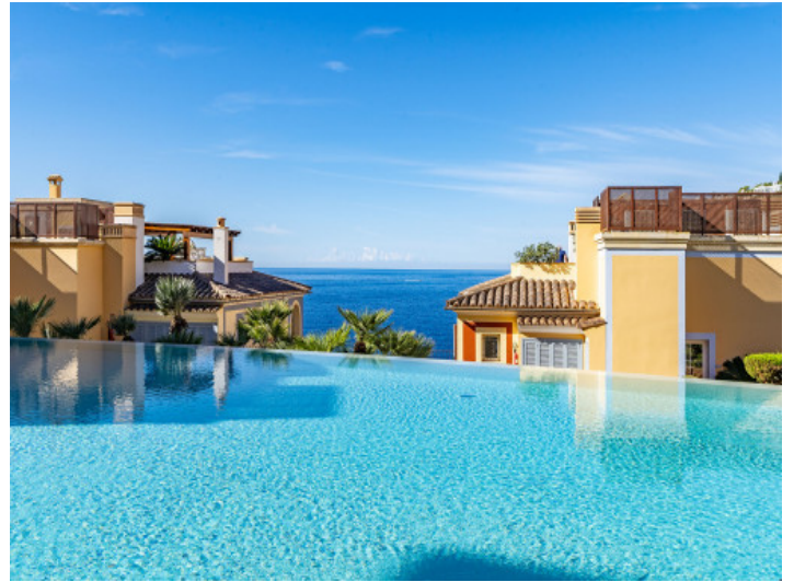
Communal infinity pool