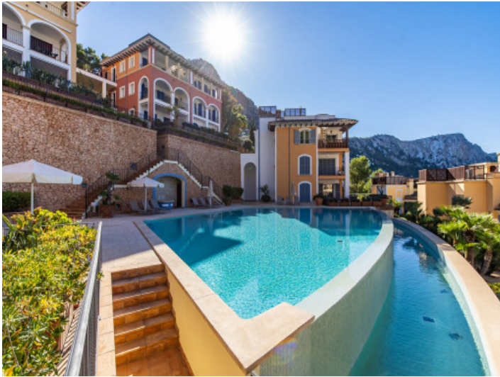
Flat with sea views and terrace in Puerto de Andratx