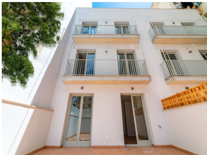
View of the building