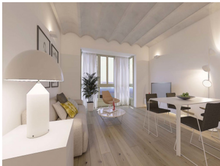
Living and dining area