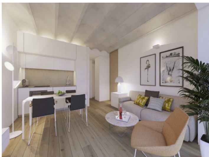
Living and dining area