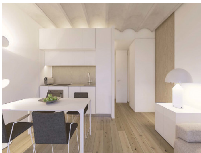
Dining area and kitchen