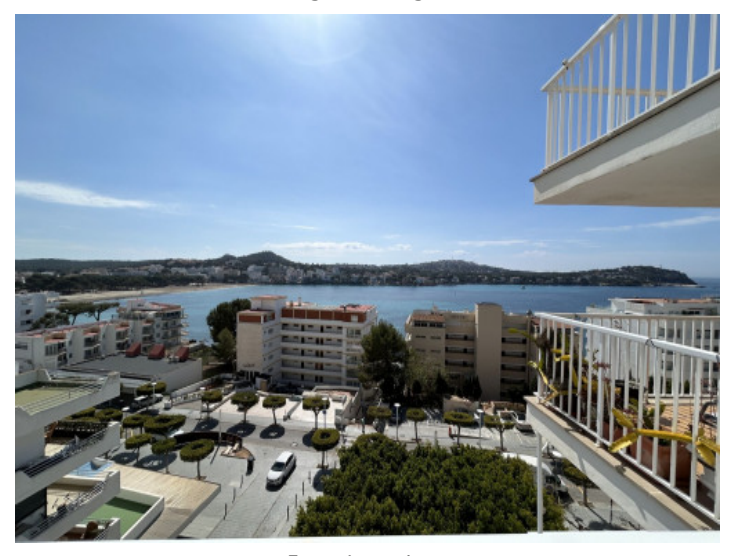
Frontal sea views

All information is correct to the best of our knowledge. Errors and prior sale excepted. This prospectus is purely for information purposes. Only the notarized deed of sale is legally binding.