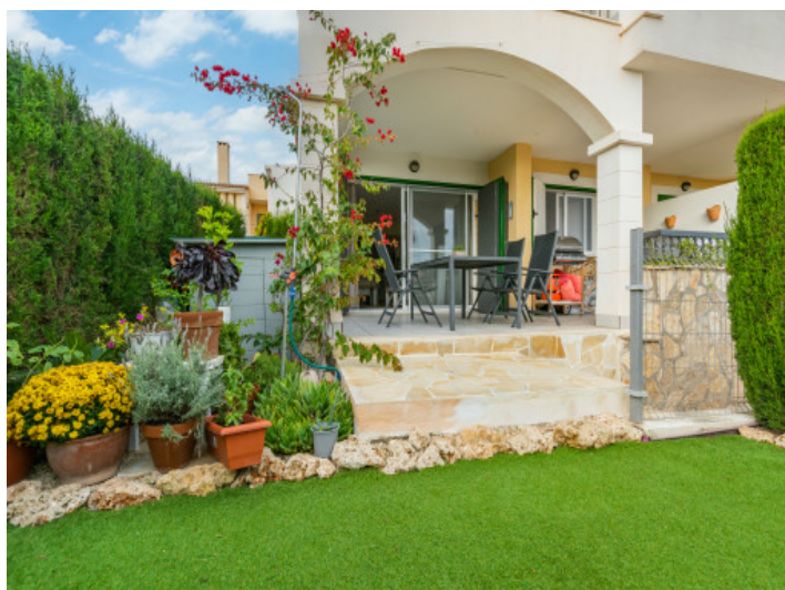
Lovely terrace and garden area