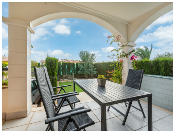
Covered outdoor dining area