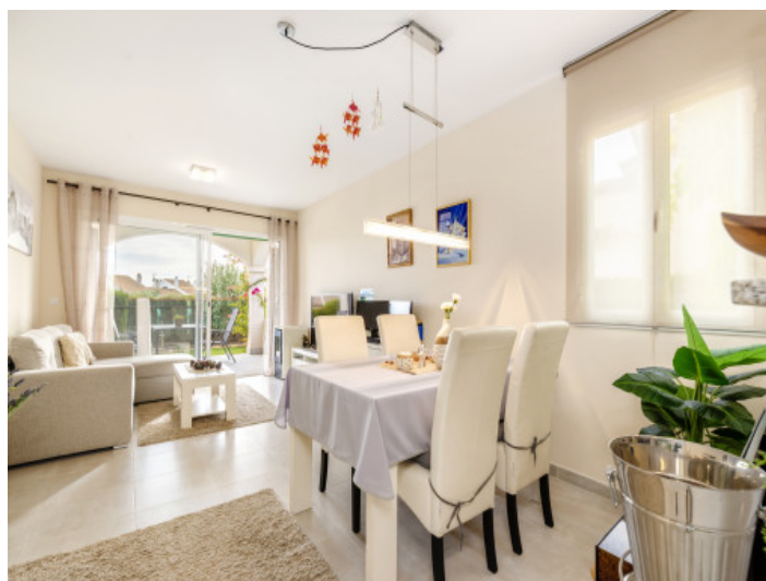
Modern living and dining area