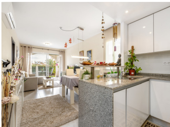
Adjoining, open kitchen