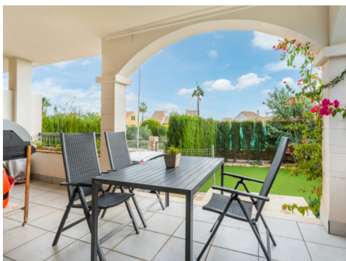
Terrace with garden views