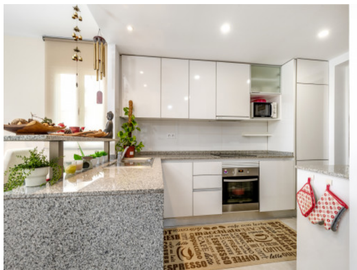
Modern fully equipped kitchen

All information is correct to the best of our knowledge. Errors and prior sale excepted. This prospectus is purely for information purposes. Only the notarized deed of sale is legally binding.