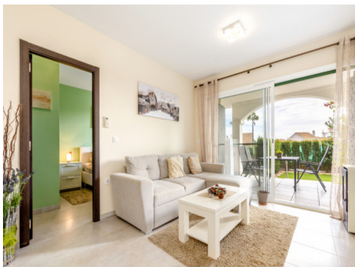
Lightflooded living area