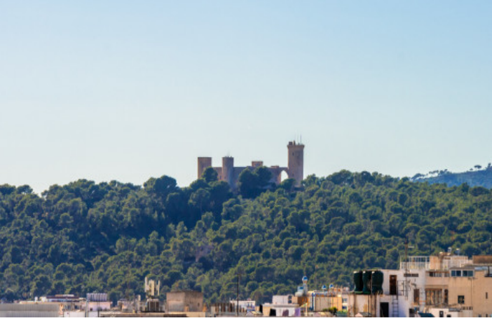
Castell Bellver All information is correct to the best of our knowledge. Errors and prior sale excepted. This prospectus is purely for information purposes. Only the notarized deed of sale is legally binding.

PORTA MALLORQUINA • THERESIENSTR.: 81, 80333 MUNICH TEL. +34 971 698 242 • INFO@PORTAMALLORQUINA.COM