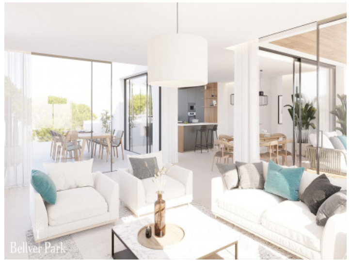
Open plan design