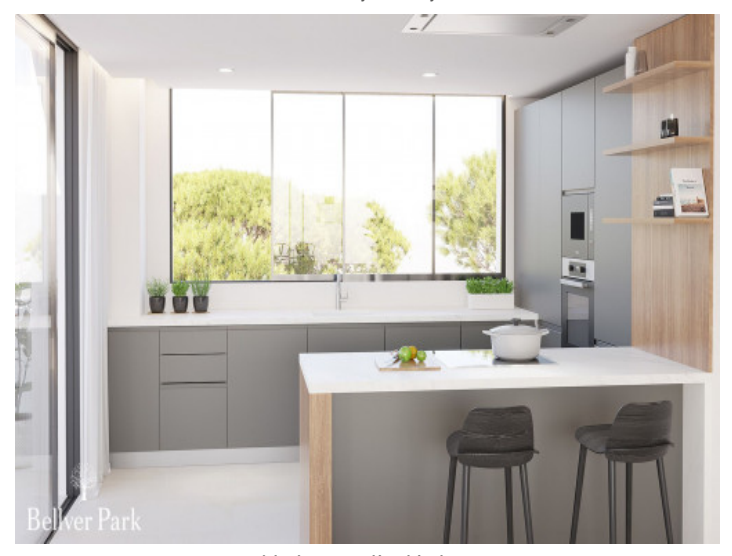
Modern quality kitchen