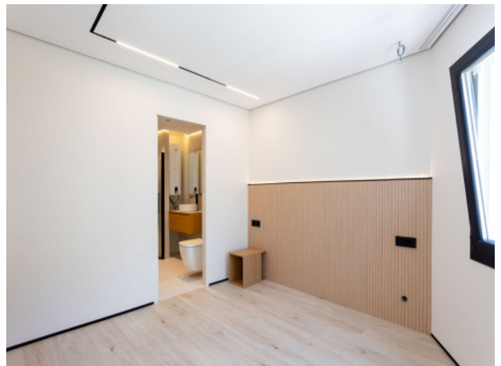
Masterbedroom with bathroom en suite

All information is correct to the best of our knowledge. Errors and prior sale excepted. This prospectus is purely for information purposes. Only the notarized deed of sale is legally binding.