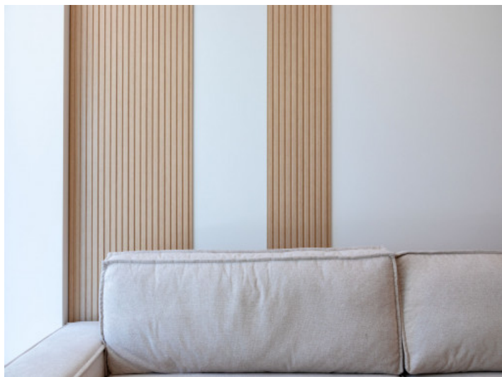
Living room detail