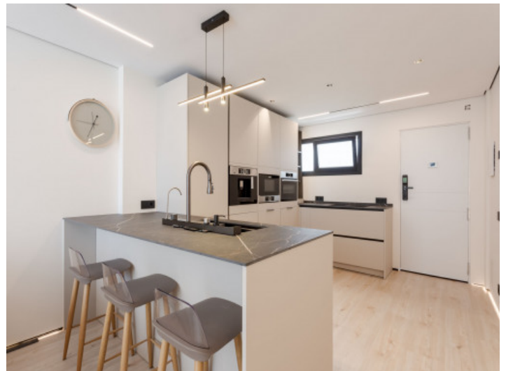
Kitchen with cooking island