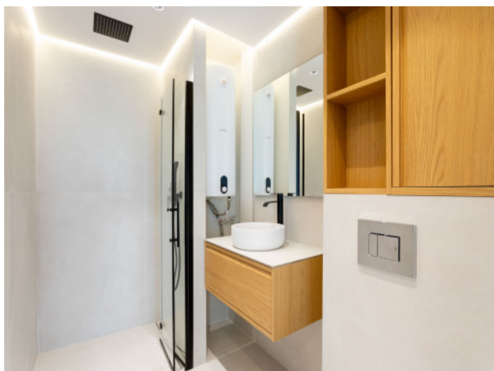
En suite bathroom