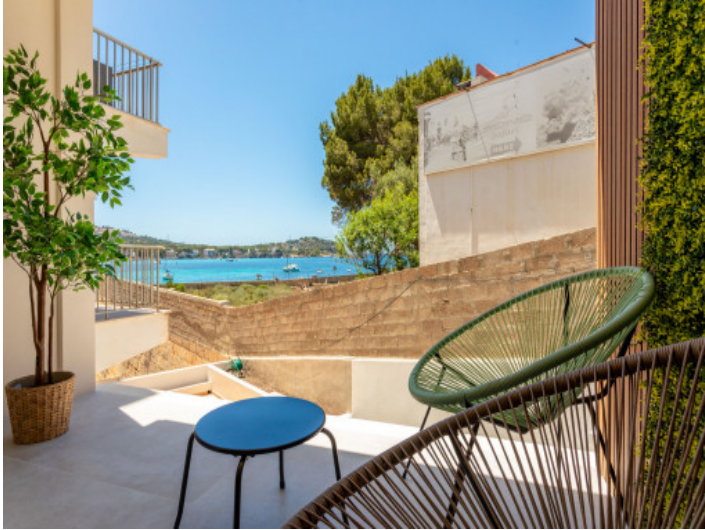
Terrace with sea view