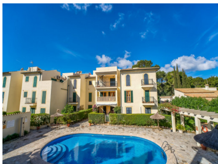
Complex and pool area