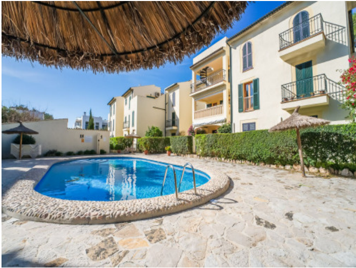
Communal pool area