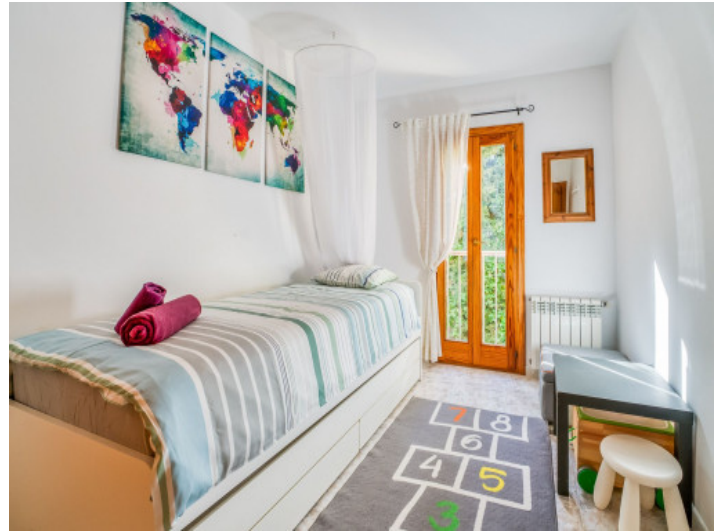
First single bedroom