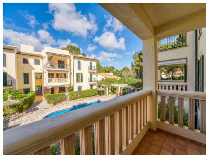
View to the pool area