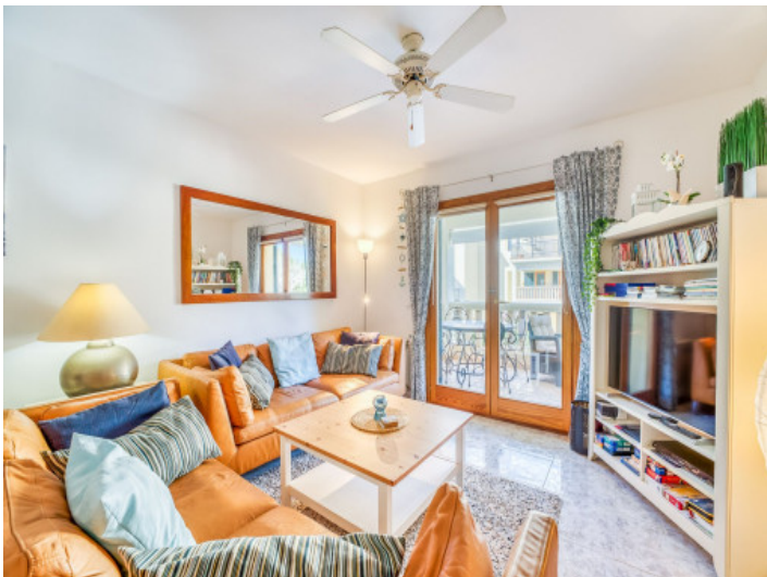
Living area with terrace access