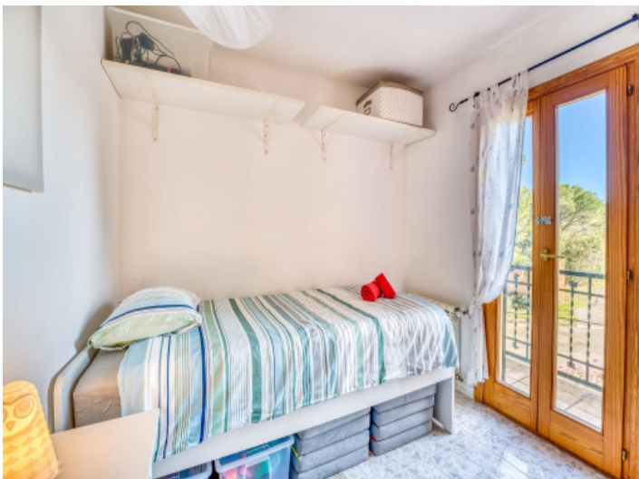
The fourth bedroom