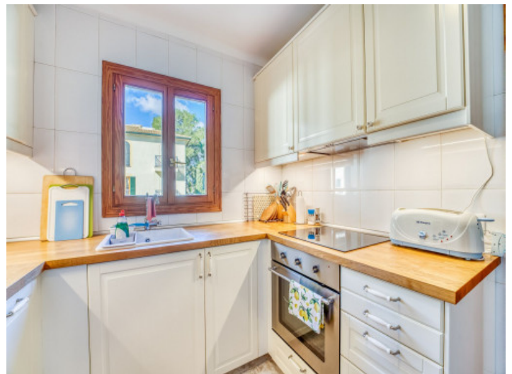
Fully equipped kitchen

All information is correct to the best of our knowledge. Errors and prior sale excepted. This prospectus is purely for information purposes. Only the notarized deed of sale is legally binding.