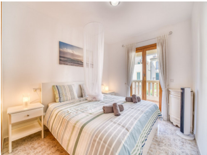
Bedroom with own terrace