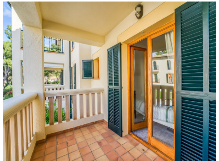
Terrace of the bedroom