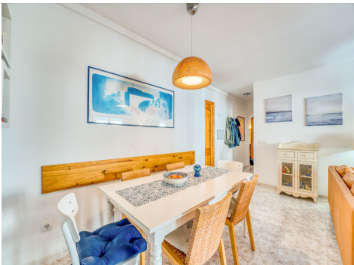
Spacious dining area