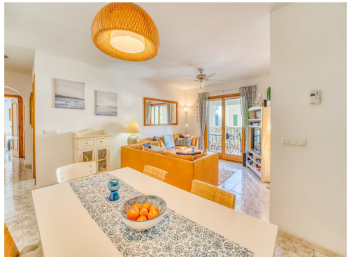
Adjoining dining area