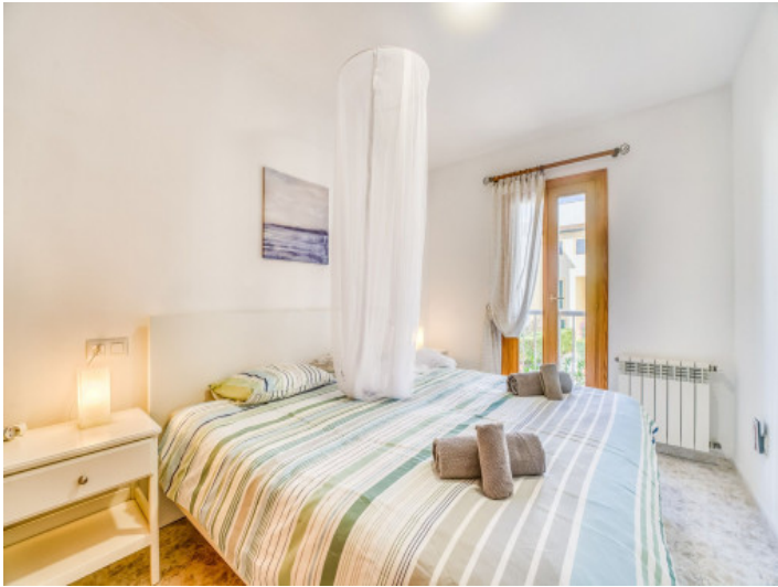
First double bedroom