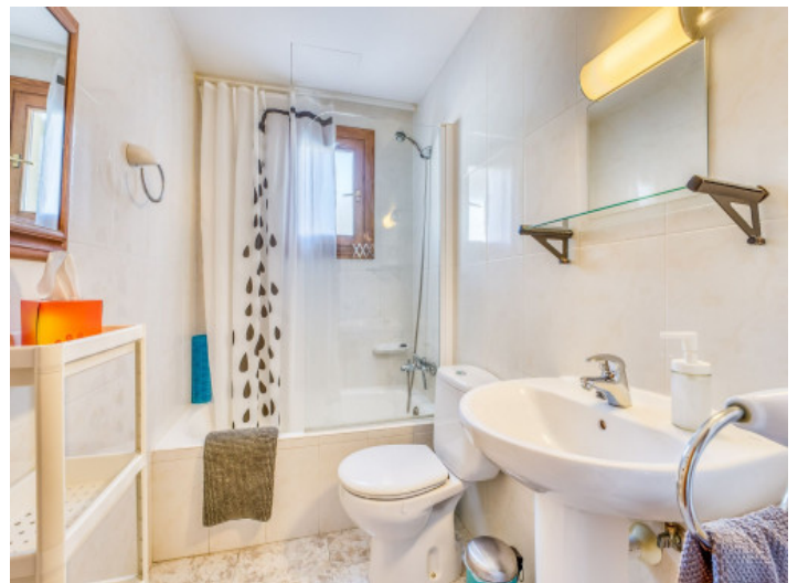
Bathroom with bathtub

All information is correct to the best of our knowledge. Errors and prior sale excepted. This prospectus is purely for information purposes. Only the notarized deed of sale is legally binding.