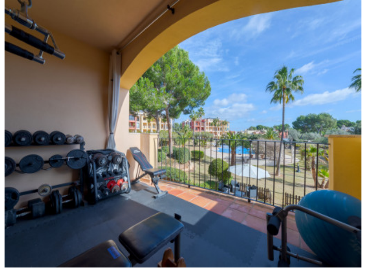
Covered terrace overlooking the community garden and pool