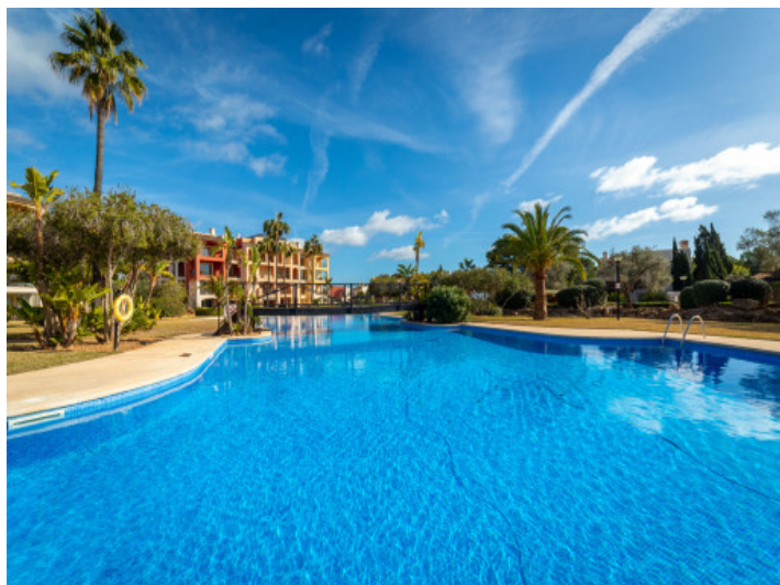
Large community pool