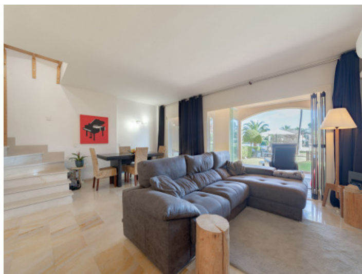
Spacious living and dining area