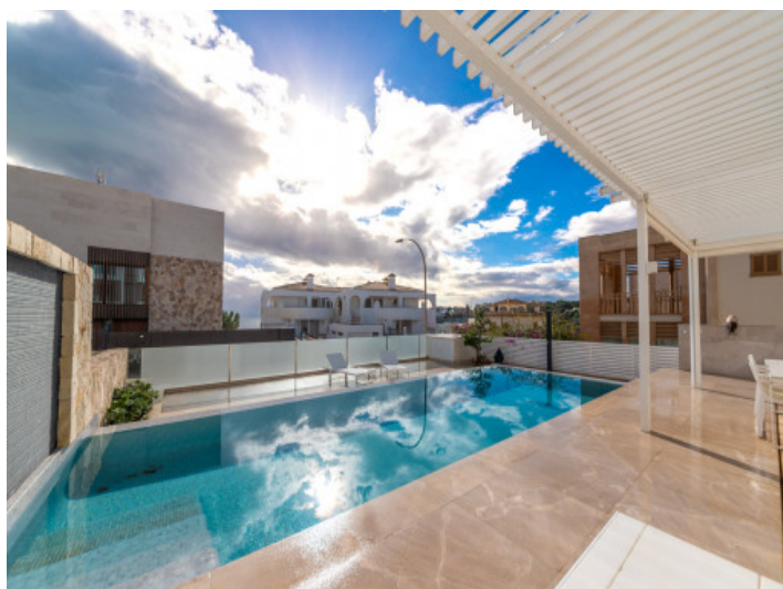
Porched veranda with views