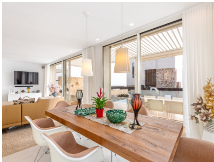
Large dining area