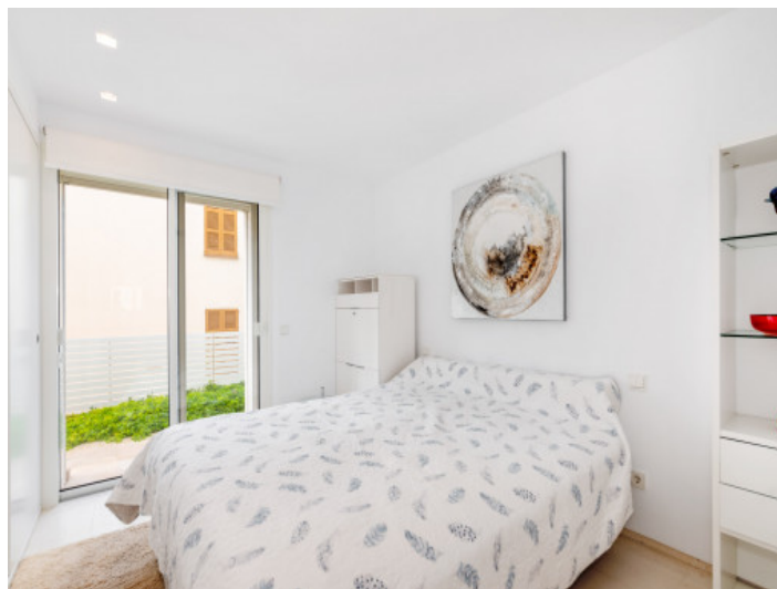
2nd sunny bedroom