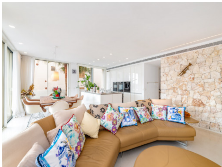
Natural stone wall give the apartment the mediterranean touch