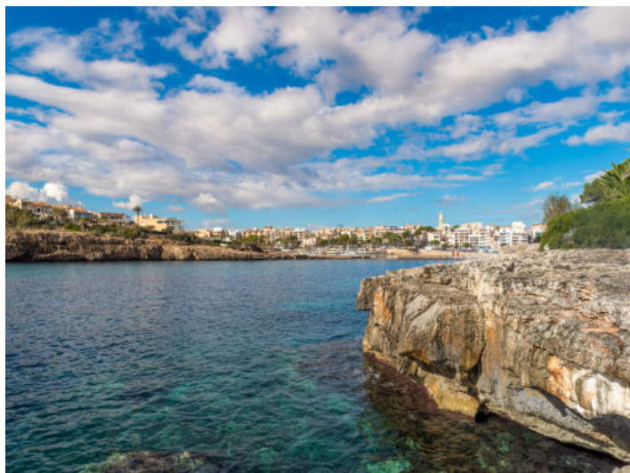
Close to the the harbour of Porto Cristo