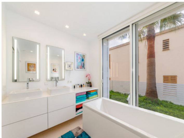
Double washbasin and bathtub