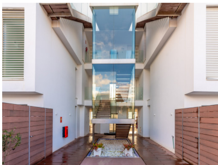
Entrance to the exclusive community