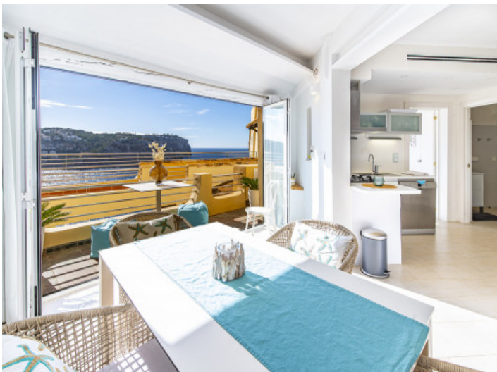
Dining area with mediterranean sea views