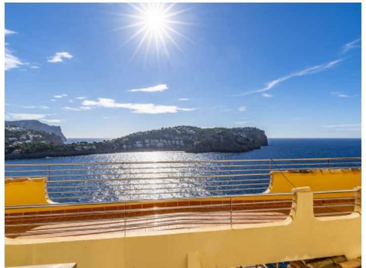
Apartment with private sea access