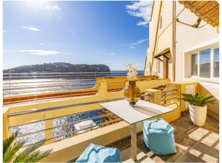
Gorgeous sea views from the balcony