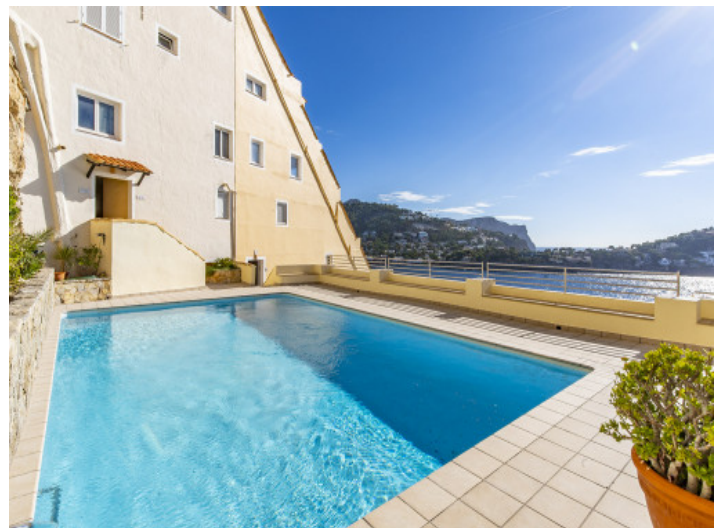
Community pool is surrounded by a terrace

All information is correct to the best of our knowledge. Errors and prior sale excepted. This prospectus is purely for information purposes. Only the notarized deed of sale is legally binding.