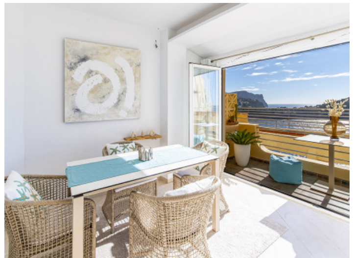
Dining area with balcony access

All information is correct to the best of our knowledge. Errors and prior sale excepted. This prospectus is purely for information purposes. Only the notarized deed of sale is legally binding.