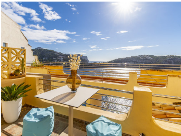
Views over the sea from the balcony