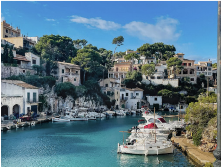
Port of Cala Figuera