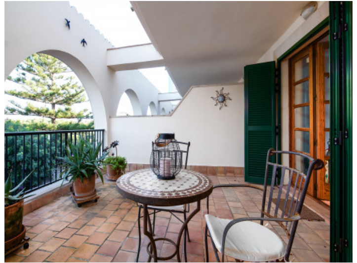
Large, roofed terrace