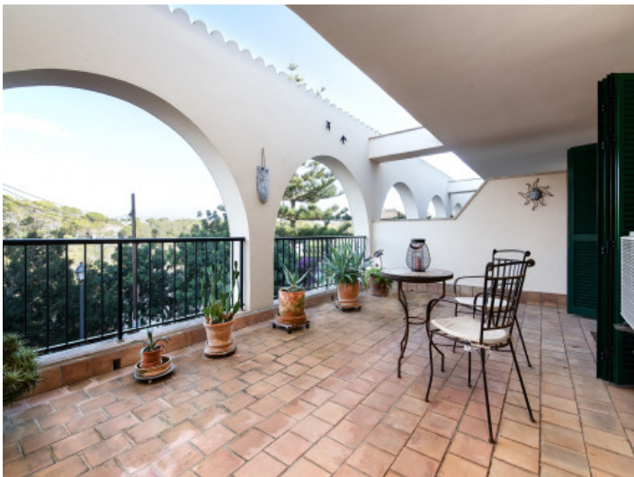
Terrace with beautiful view