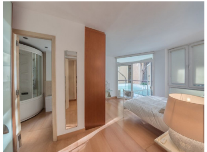
The bedroom provides a bathroom en suite