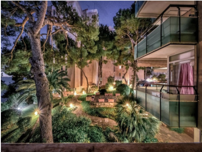
Beautiful outdoor area