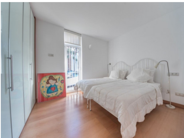
Further double bedroom