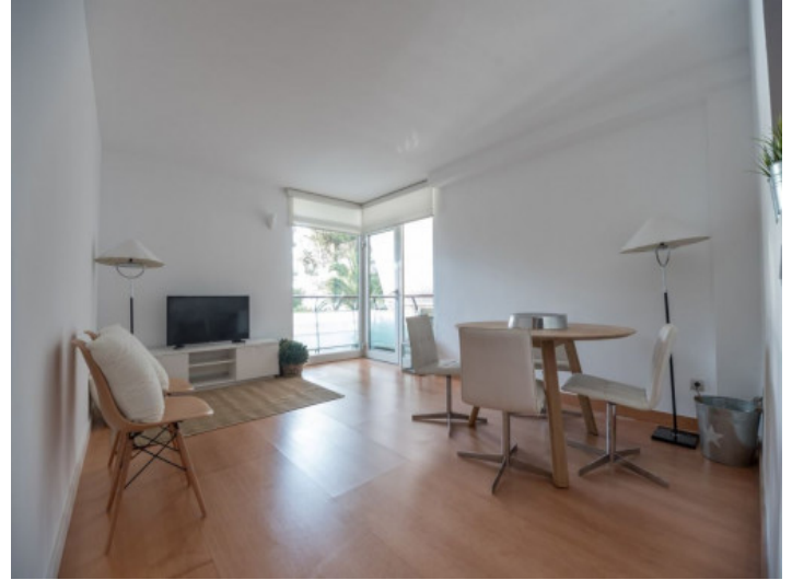
Light-flooded living and dining area