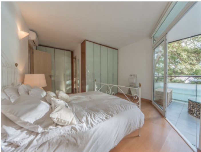
Charming bedroom with access to the balcony