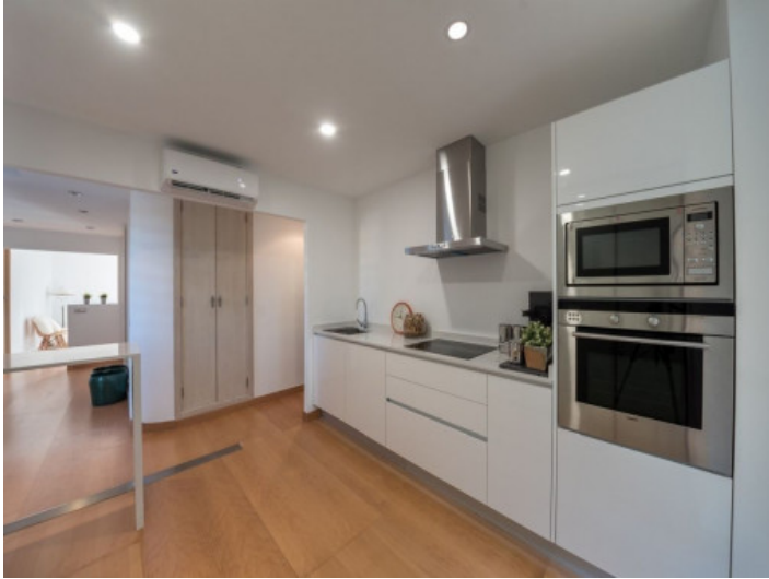
Fully equipped, modern kitchen