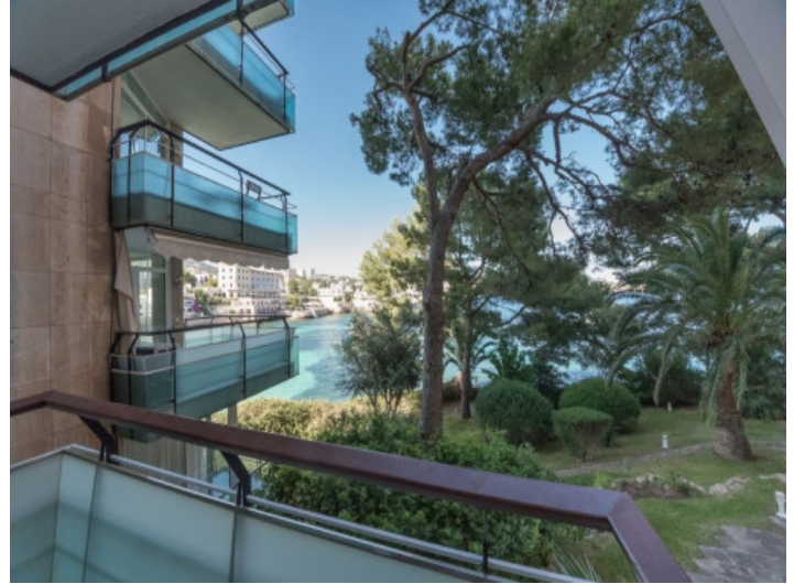
Gorgeous sea views from the balcony