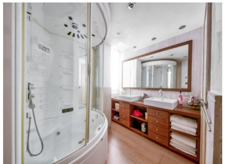
Wonderful bathroom with bathtub

All information is correct to the best of our knowledge. Errors and prior sale excepted. This prospectus is purely for information purposes. Only the notarized deed of sale is legally binding.