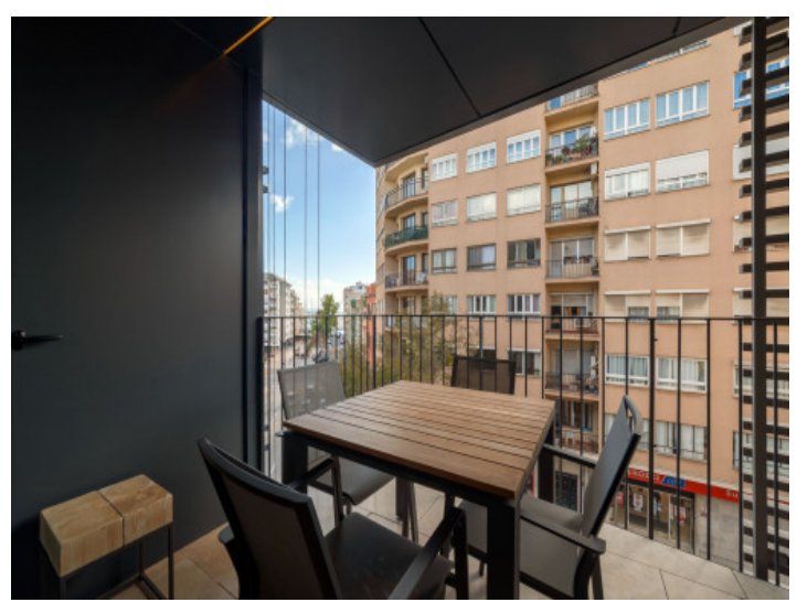
Balcony with views to the neighbourhood