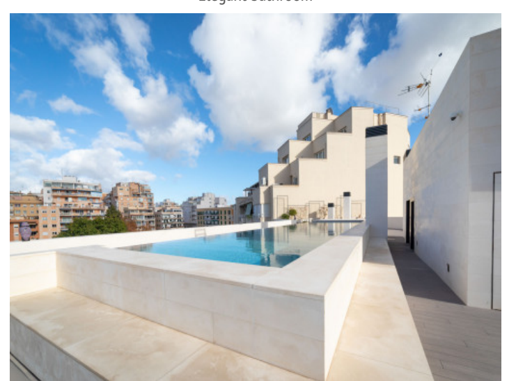
Pool is surrounded by a terrace