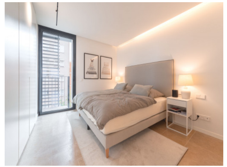
Bedroom with floor to ceiling windows