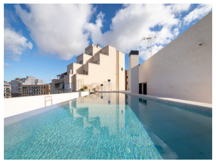
Spacious pool area