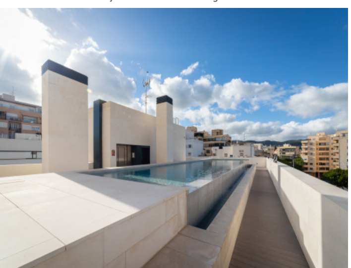
Roof terrace with pool