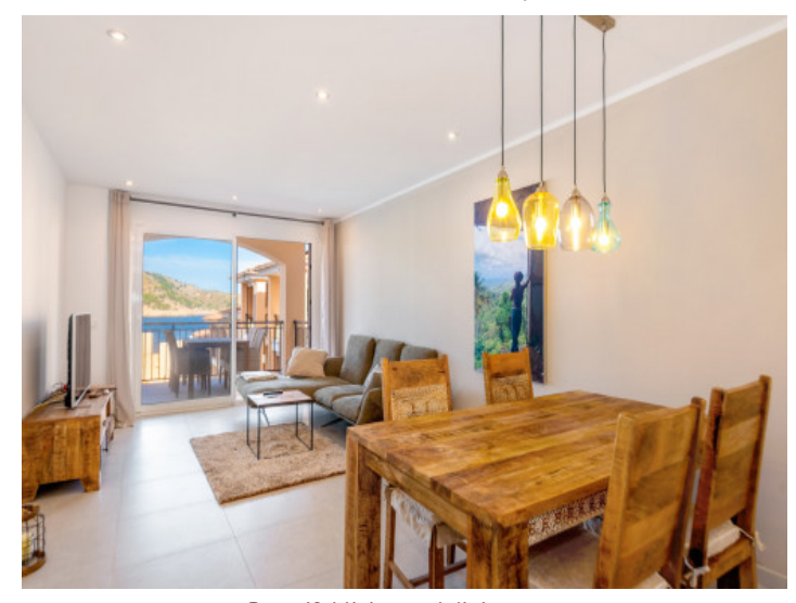
Beautiful living and dining area