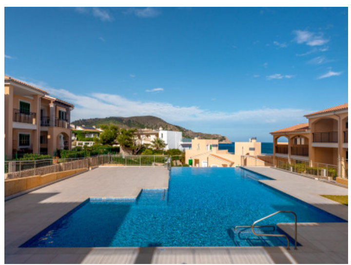
Well-tended pool area