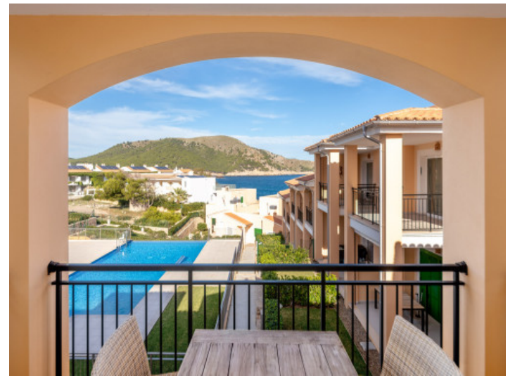
Covered sea view balcony