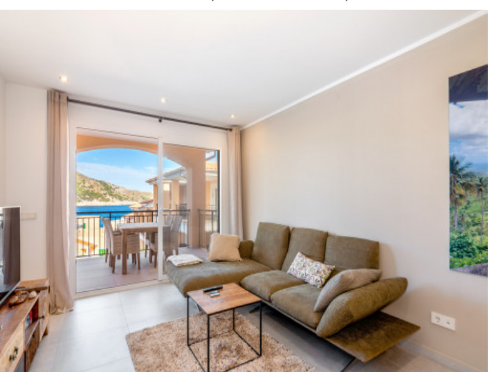
Living area with balcony access