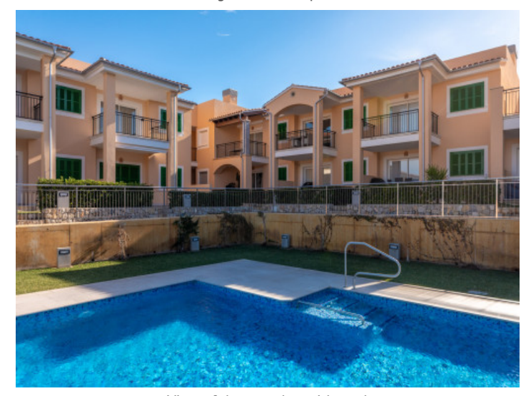
View of the complex with pool