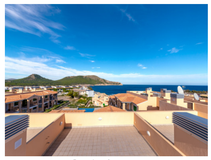
Fantastic roof top terrace