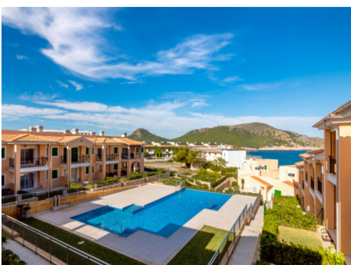
Wonderful complex with communal pool