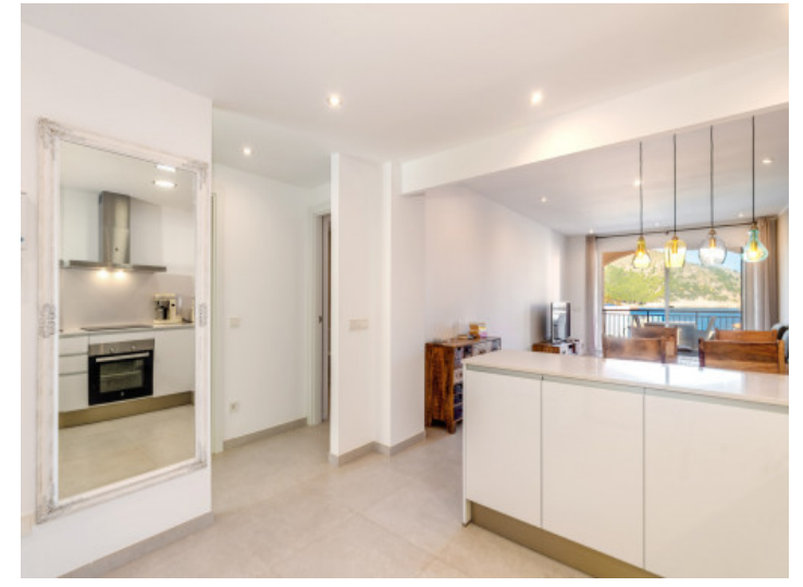
Alternative kitchen view