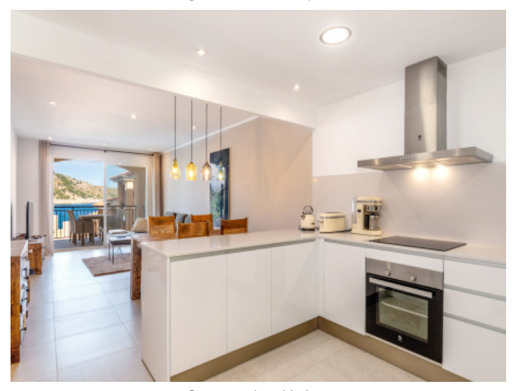
Open, modern kitchen

All information is correct to the best of our knowledge. Errors and prior sale excepted. This prospectus is purely for information purposes. Only the notarized deed of sale is legally binding.