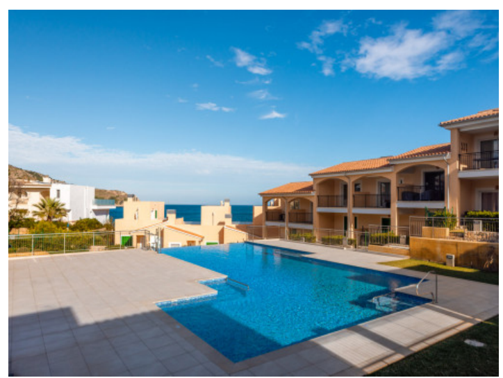
Large communal pool