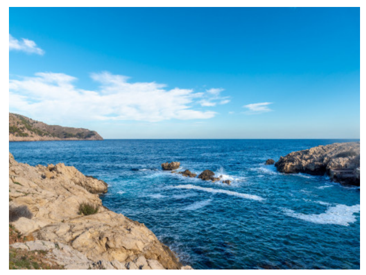
Stunning location in first sea line