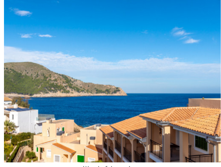
Wonderful sea views