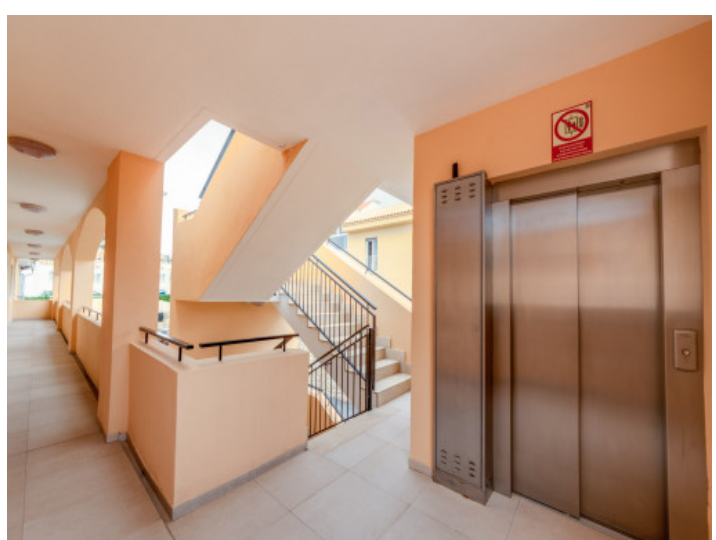
Elevator in the community