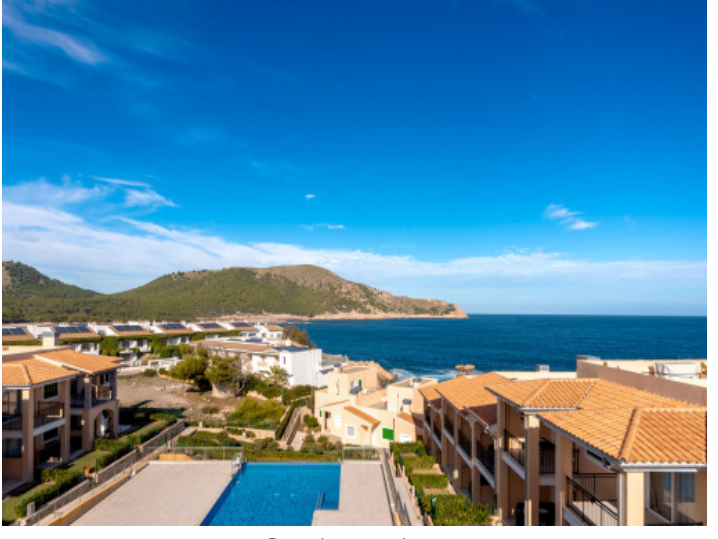
Stunning sea views

All information is correct to the best of our knowledge. Errors and prior sale excepted. This prospectus is purely for information purposes. Only the notarized deed of sale is legally binding.