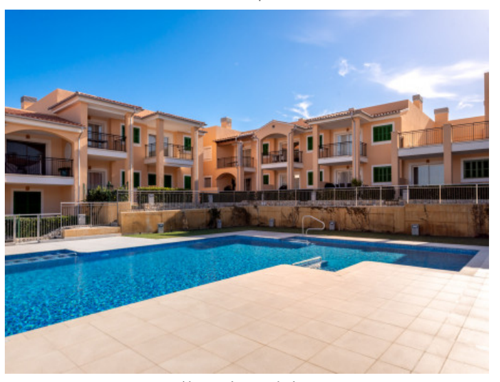
Alternative pool view