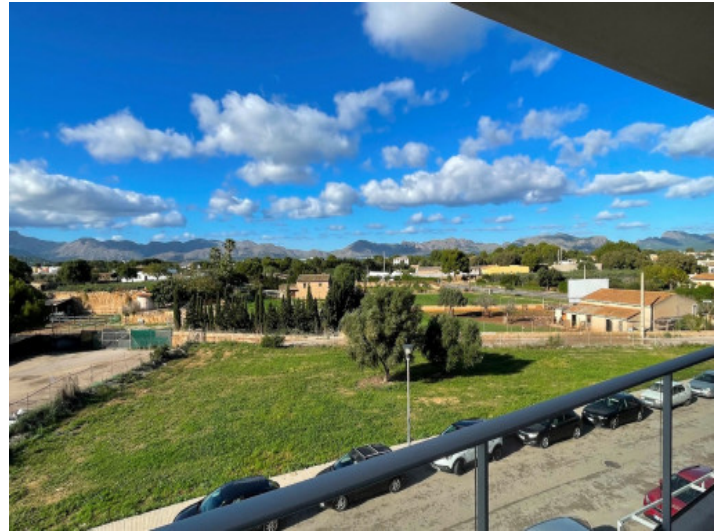
Lovely mountain view