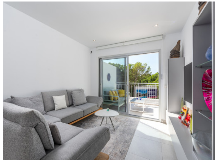
Living area with direct access to the terrace