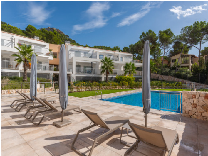
Lovely pool area