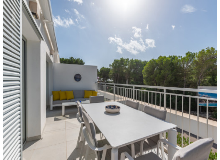
Fantastic sunny terrace