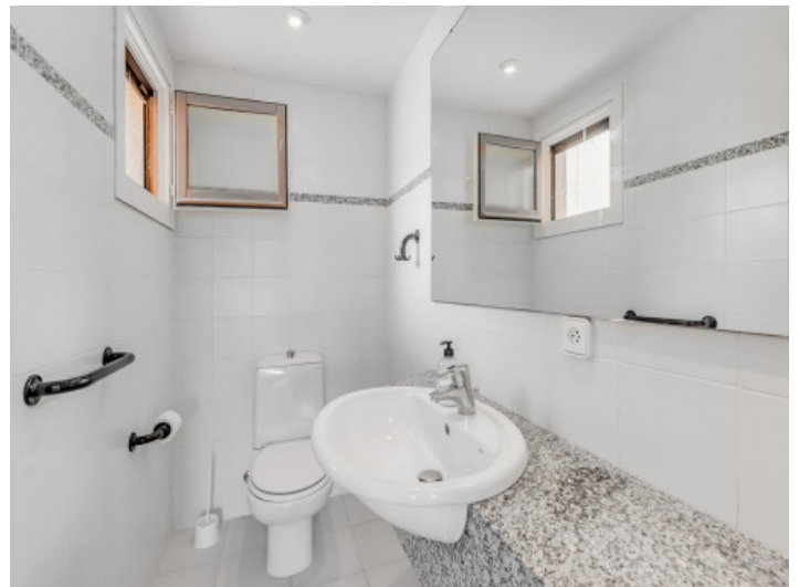
Bathroom with daylight