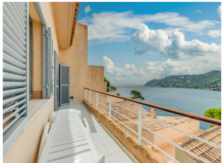
Views from the balcony to the surroundings

All information is correct to the best of our knowledge. Errors and prior sale excepted. This prospectus is purely for information purposes. Only the notarized deed of sale is legally binding.