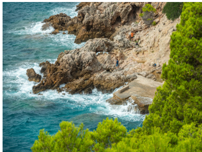
Views to the coast

All information is correct to the best of our knowledge. Errors and prior sale excepted. This prospectus is purely for information purposes. Only the notarized deed of sale is legally binding.