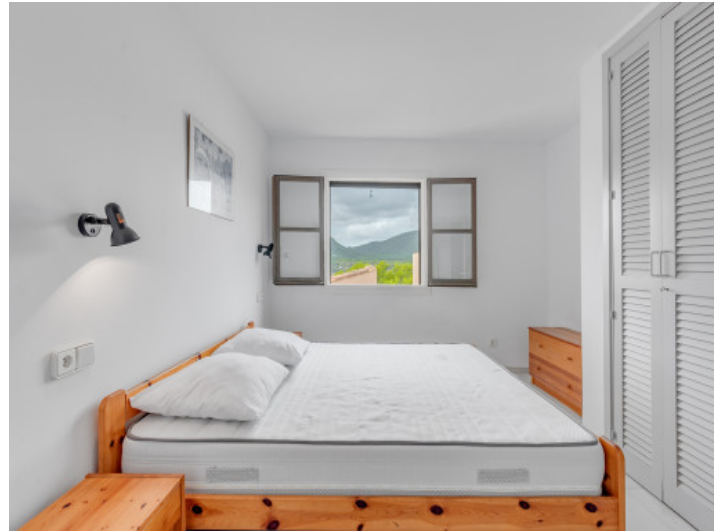
Sea views from the balcony