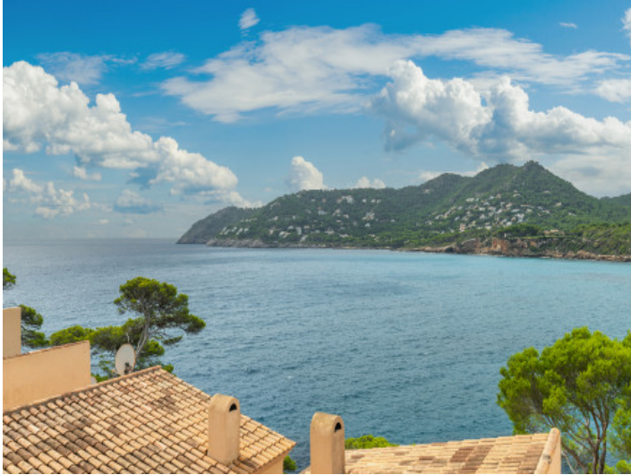
Mediterranean sea views from the balcony