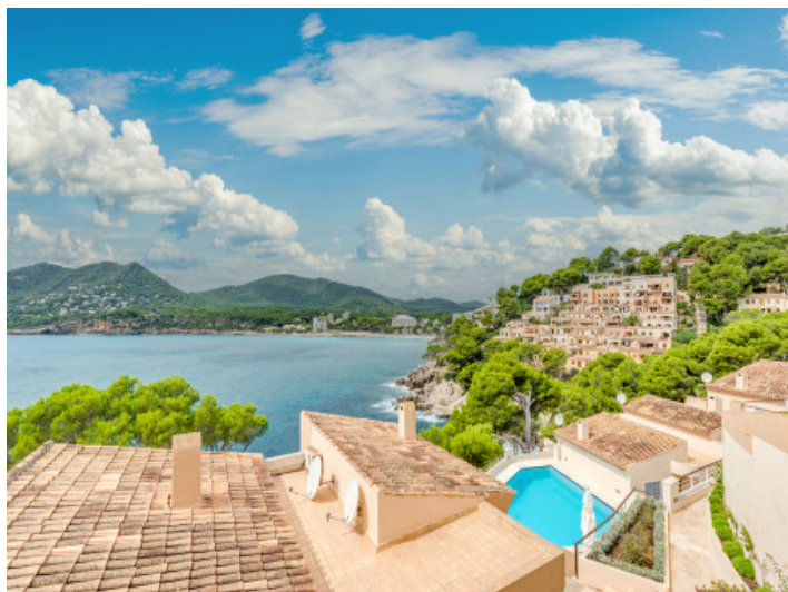
Views to the neighbourhood

PORTA MALLORQUINA® Your home. Our passion.