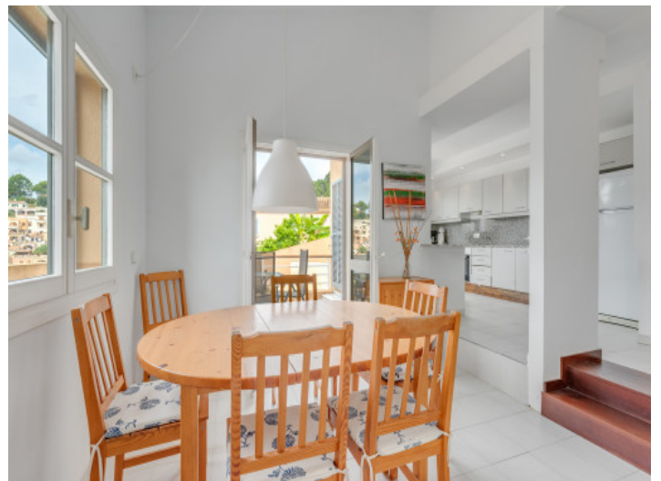
Bright dining area

All information is correct to the best of our knowledge. Errors and prior sale excepted. This prospectus is purely for information purposes. Only the notarized deed of sale is legally binding.