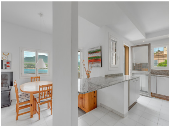
Views from the kitchen to the dining area