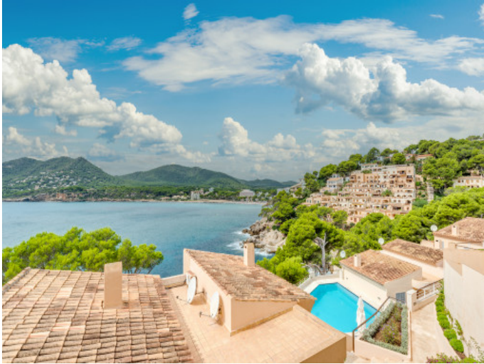
Views to the neighbourhood