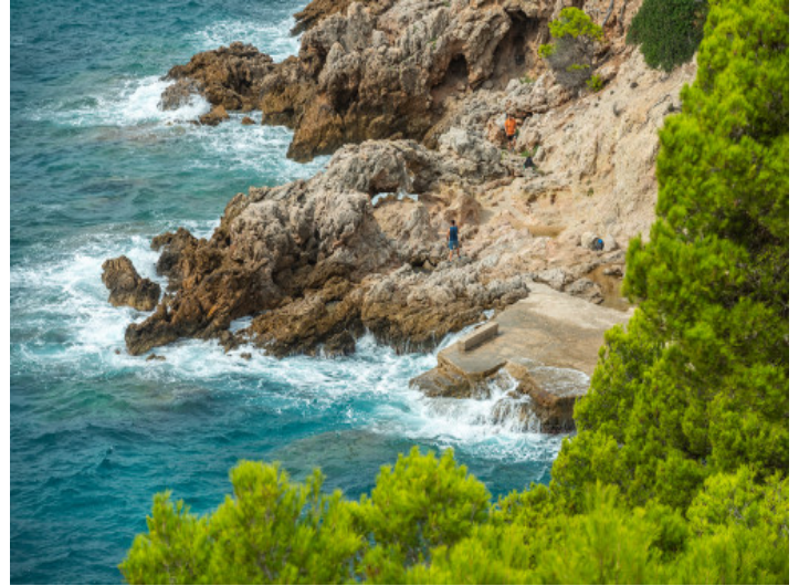
Views to the coast

All information is correct to the best of our knowledge. Errors and prior sale excepted. This prospectus is purely for information purposes. Only the notarized deed of sale is legally binding.