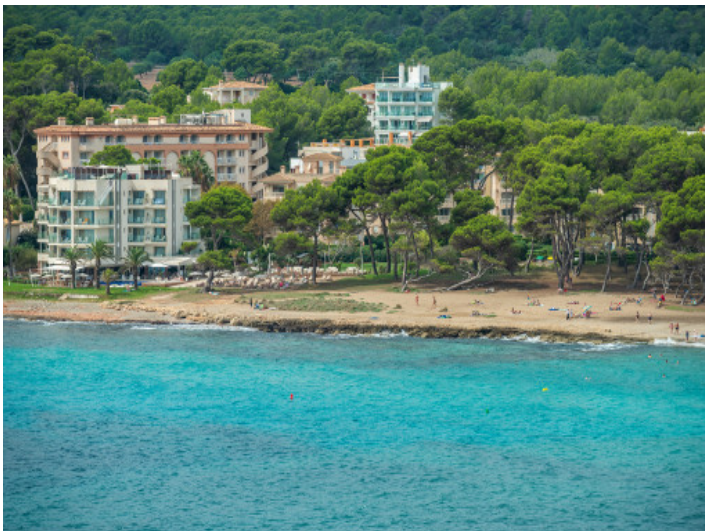
Beach views from the balcony