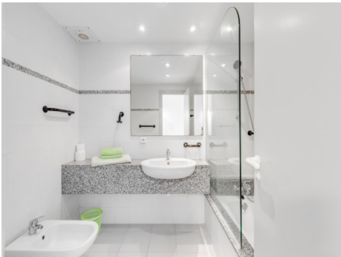
Bathroom with bathtub