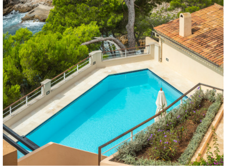
Pool views from the balcony