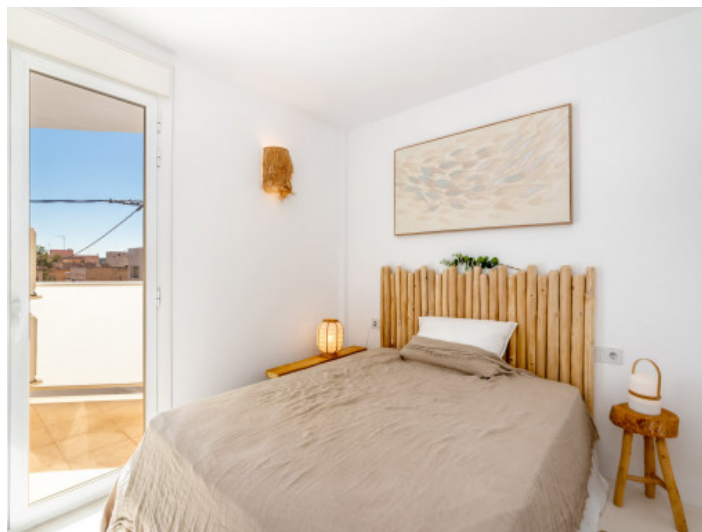
Bedroom with balcony