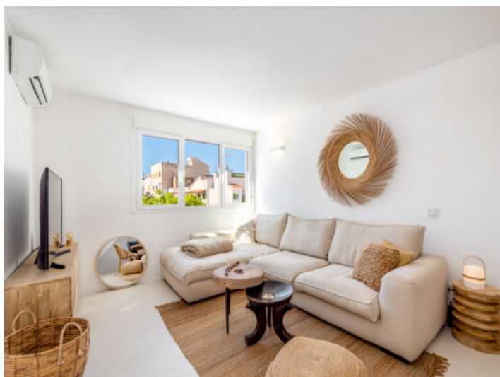
Modern living area