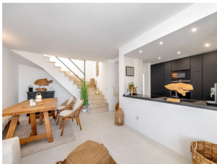
Dining area and open kitchen