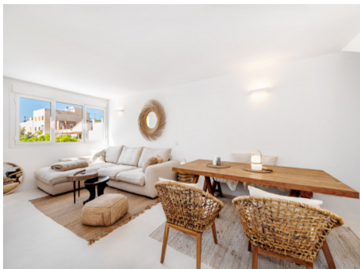
Bright living and dining area