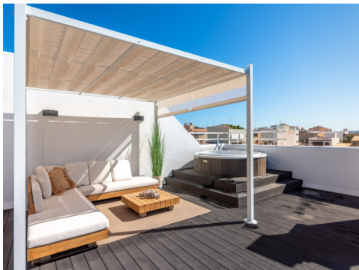
Roof terrace with jacuzzi