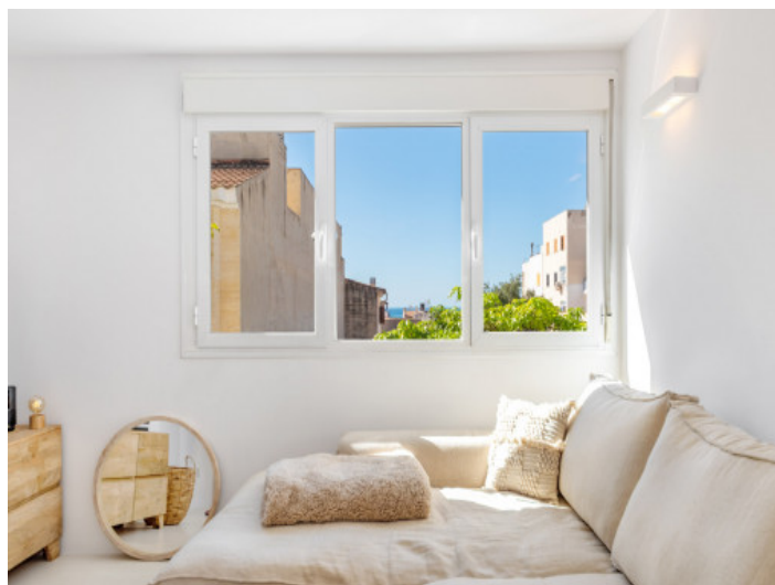
Living area with sea views

All information is correct to the best of our knowledge. Errors and prior sale excepted. This prospectus is purely for information purposes. Only the notarized deed of sale is legally binding.