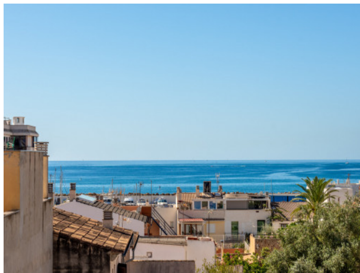
Fantastic sea views