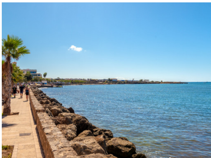
Promenade close to the flat