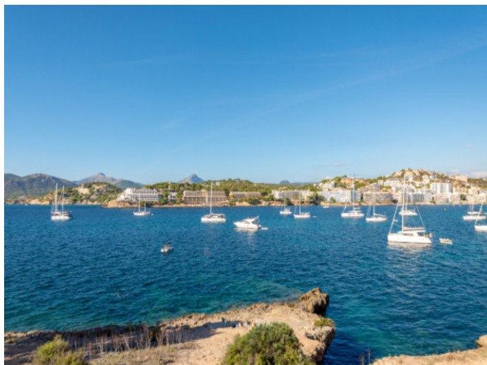
Wonderful sea views