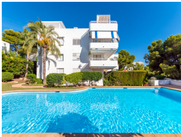
Beautiful communal pool