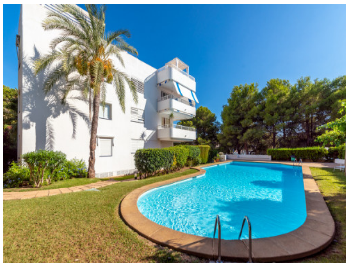
Lovely garden and pool