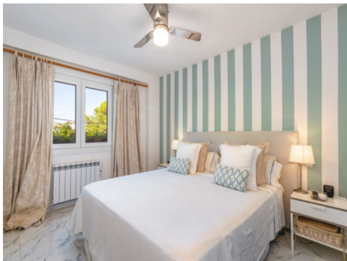
Cosy double bedroom