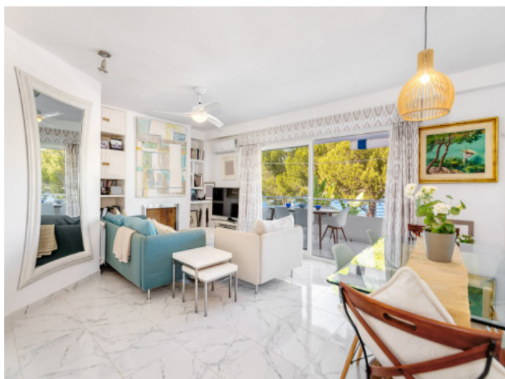
Living area with balcony access