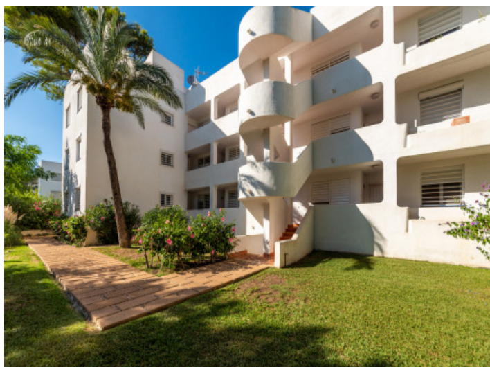
View of the building